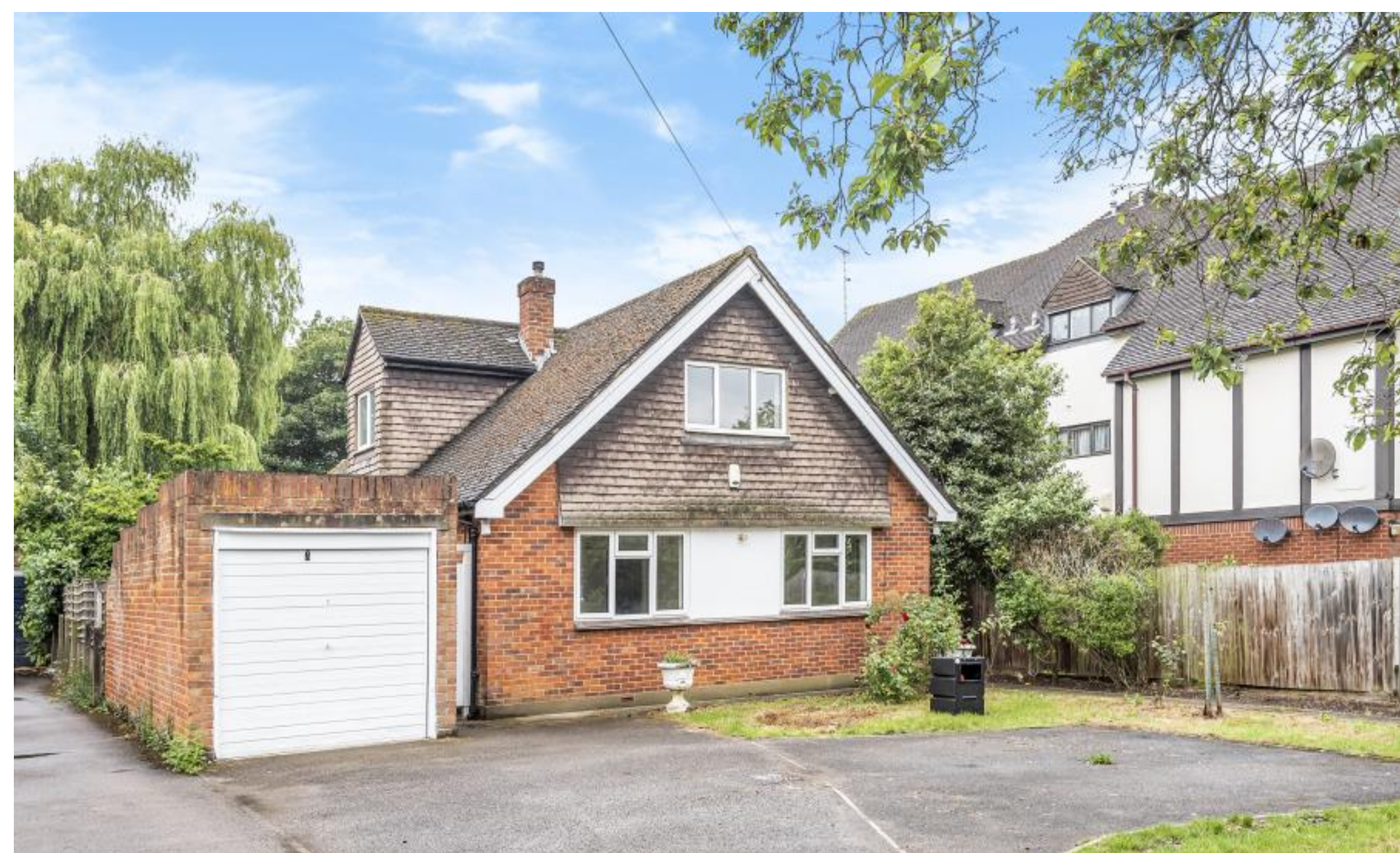
A very bright and spacious four bedroom chalet bungalow Murray Road, Northwood, Middlesex HA6 2YJ