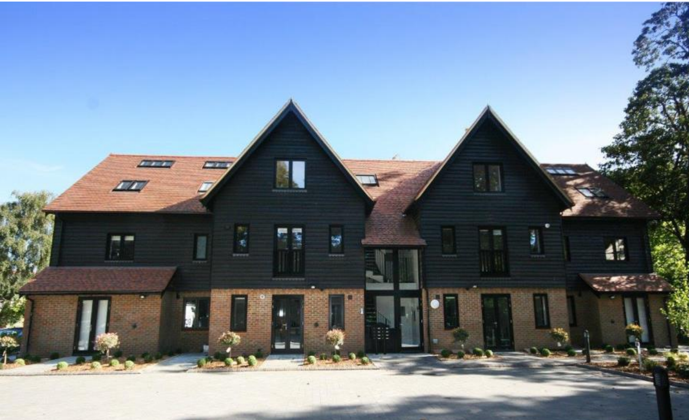
A two bedroom first floor apartment in the heart of Rickmansworth The Coach House, Rickmansworth, Hertfordshire WD3 1DP