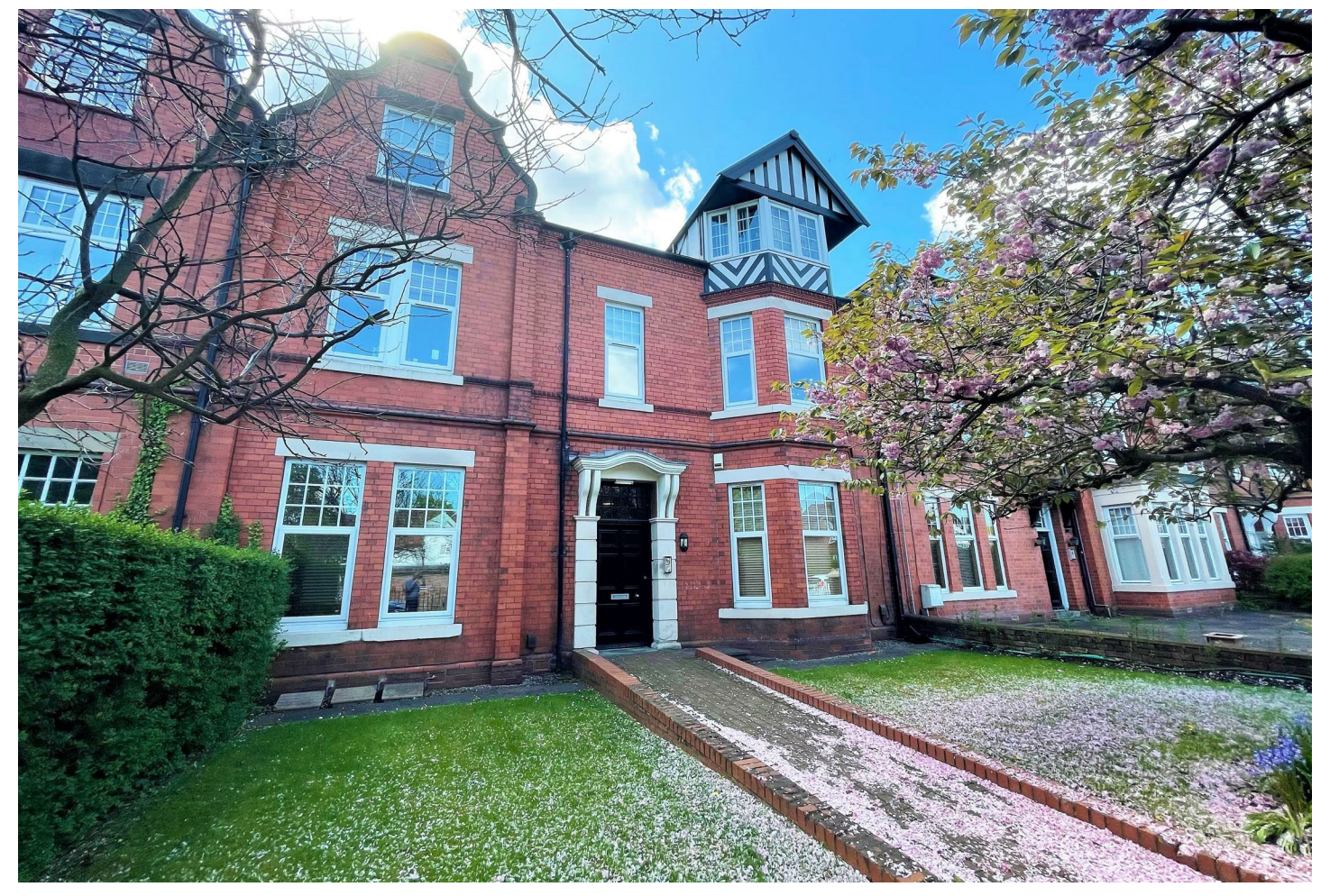
Flat 3 133 Osborne Road, Newcastle upon Tyne, NE2 £1,150 PCM