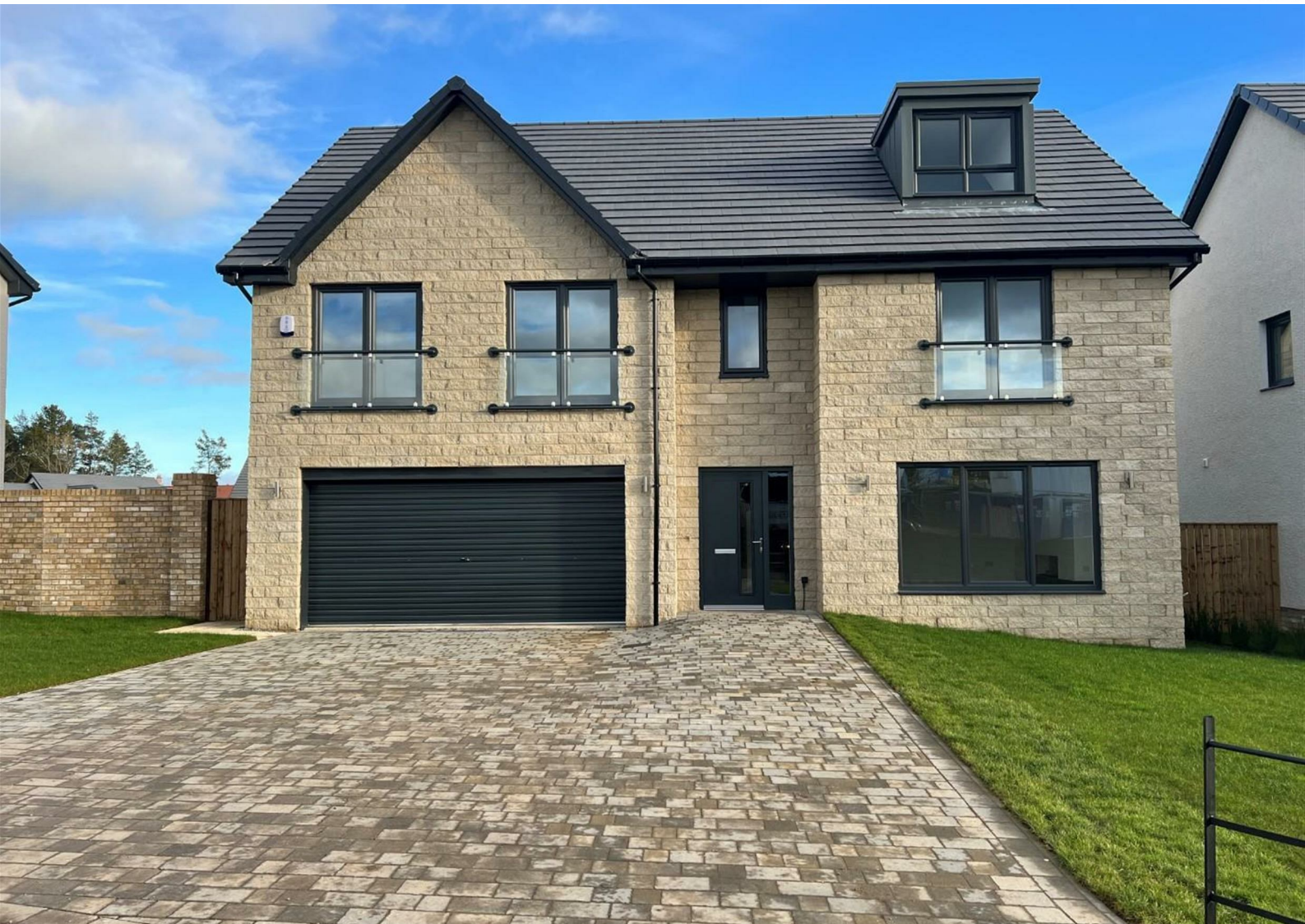
3 Runnel Close Wynyard Estate | TS22 5UQ