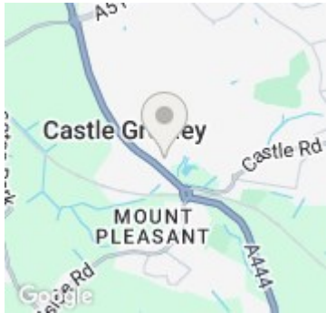
Illustration for identification purposes only, measurements are approximate and not to scale, unauthorised reproduction is prohibited.

Approx. Gross Internal Floor Area 1,476 sq. ft / 137.10 sq. m.