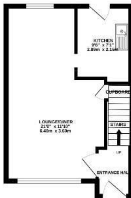
GROUND FLOOR 324 sq.ft. (30.1 sq.m.) approx.