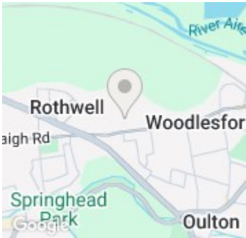
Illustration for identification purposes only, measurements are approximate and not to scale, unauthorised reproduction is prohibited.

Approx. Gross Internal Floor Area 1,576 sq. ft / 146.48 sq. m.