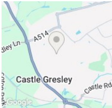
Illustration for identification purposes only, measurements approximate and not to scale, unauthorised reproduction is prohibited. Produced by designimperial.com

Approx. Gross Internal Floor Area 947 sq. ft / 88.01 sq. m