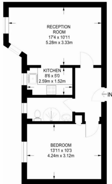
THIRD FLOOR 477 SQ FT / 44.3 SQ M