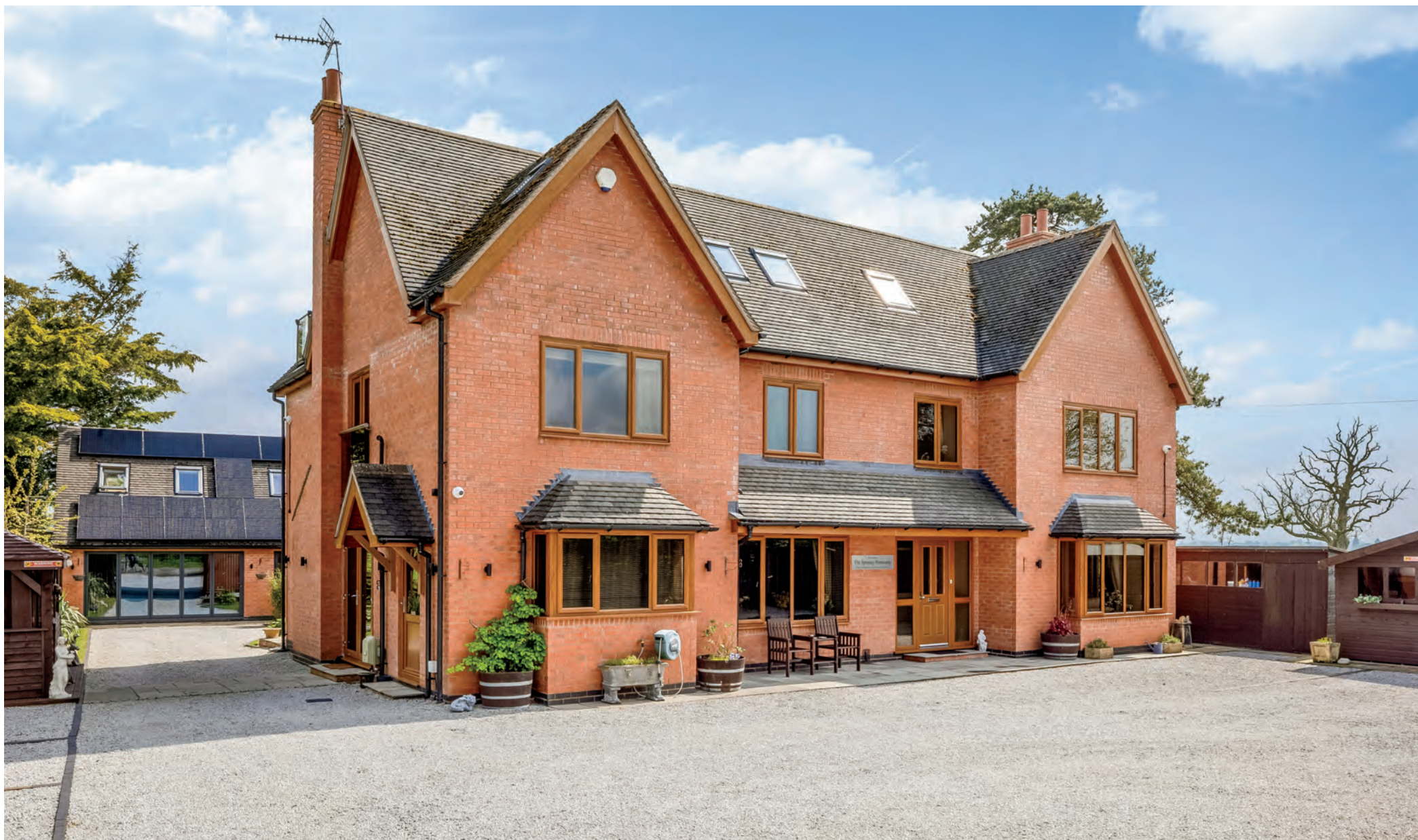
The Spinney Weston Under Wetherley | Leamington Spa | Warwickshire | CV33 9BT