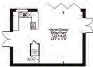
Annexe Ground Floor