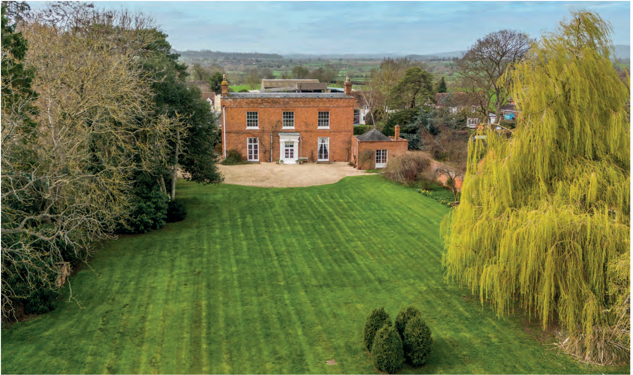
Apperley House Apperley | Gloucester | Gloucestershire | GL19 4DQ