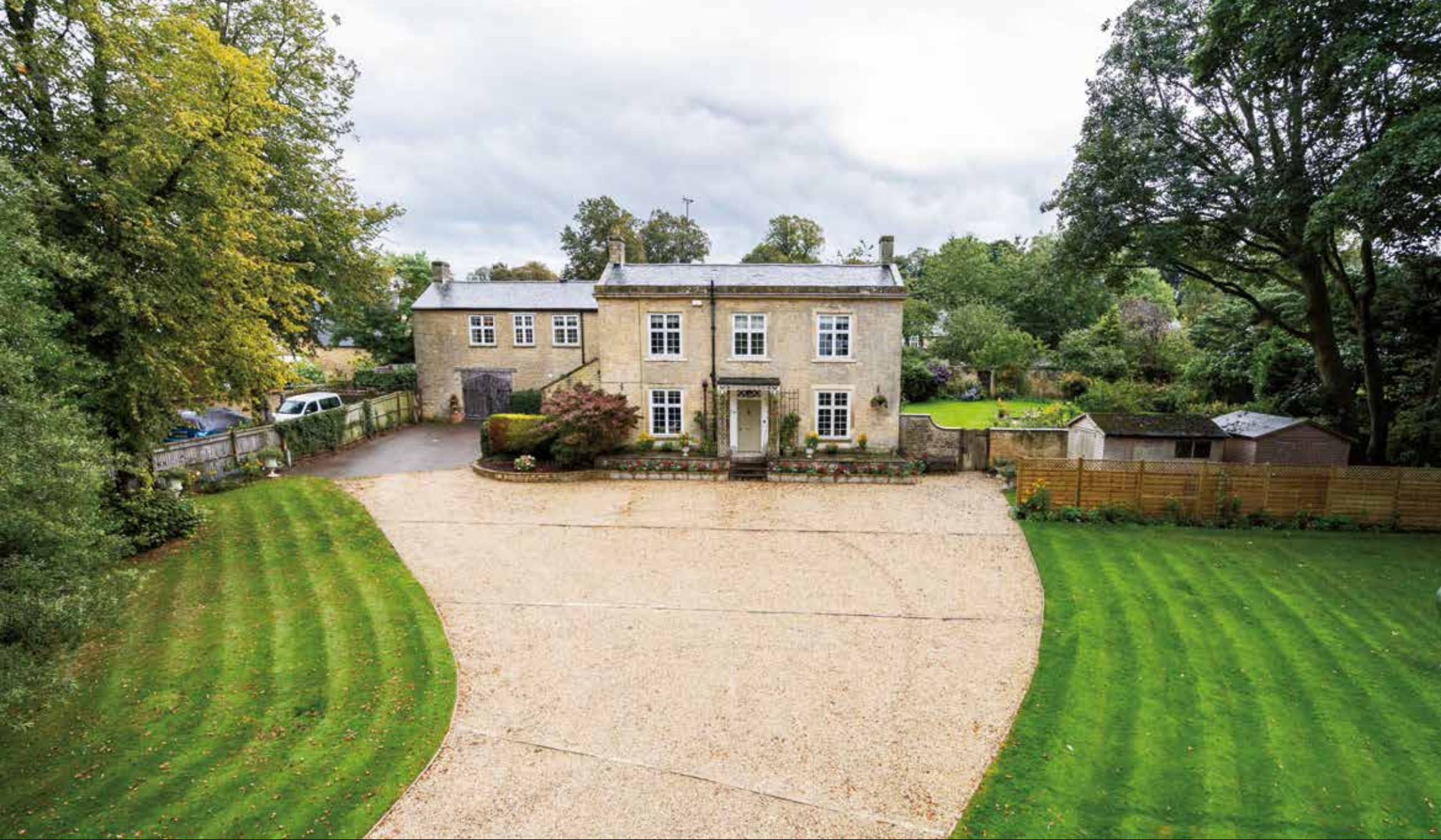
Rock Hill House Rock Hill | Chipping Norton | OX7 5BA