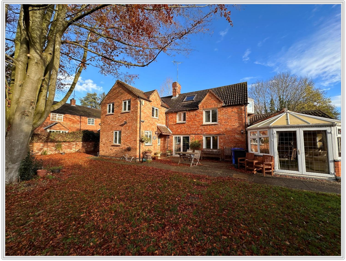
Vale Cottage, Pattishall £750,000 Freehold