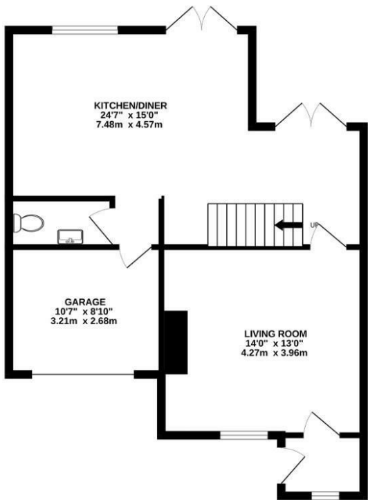
GROUND FLOOR 608 sq.ft. (56.5 sq.m.) approx.