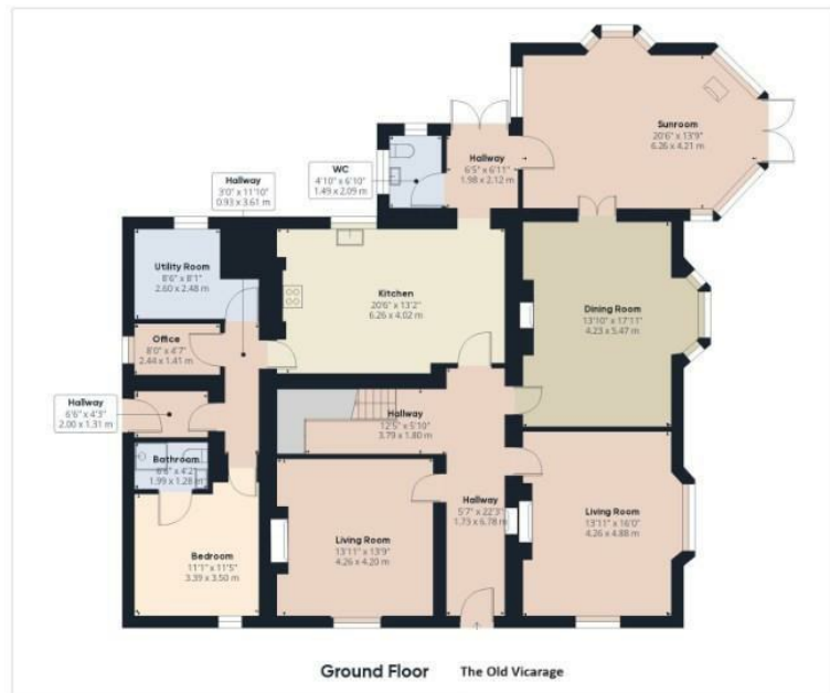
Ground Floor - The Old Vicarage