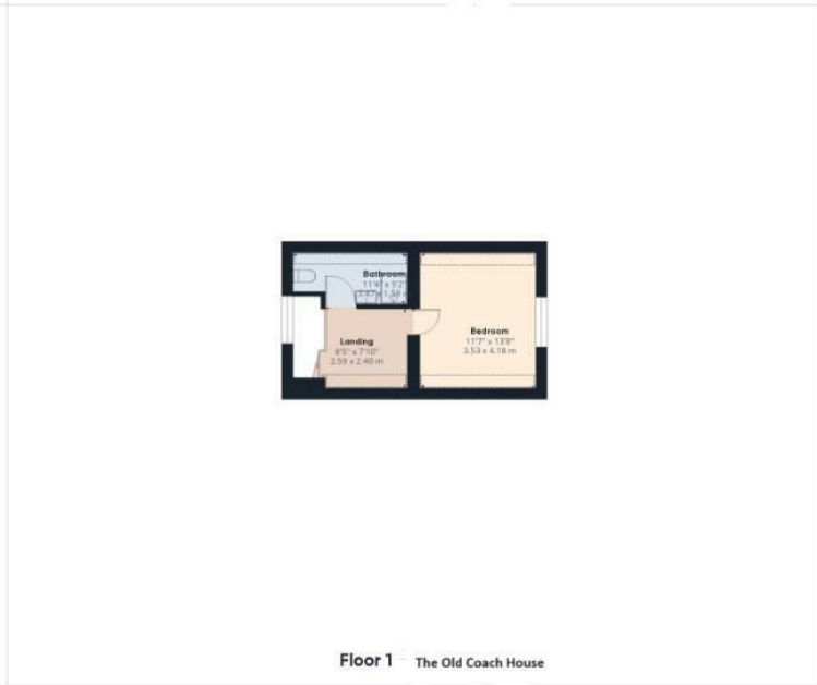
Floor 1 - The Old Coach House