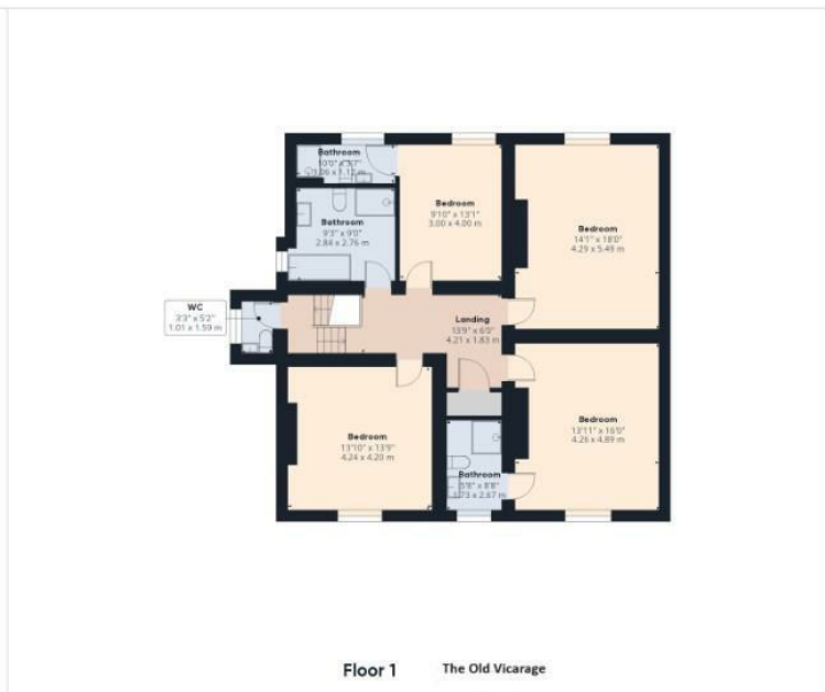
Floor 1 - The Old Vicarage