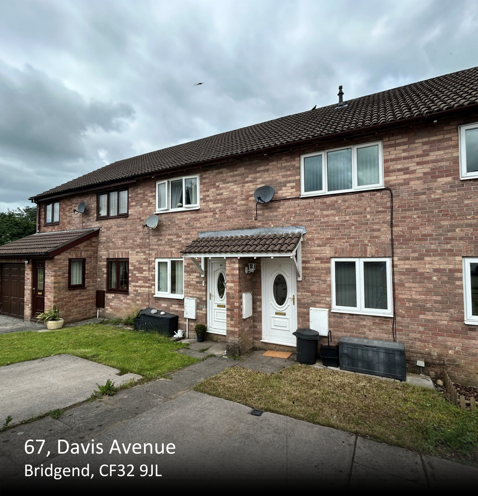
67, Davis Avenue Bridgend, CF32 9JL