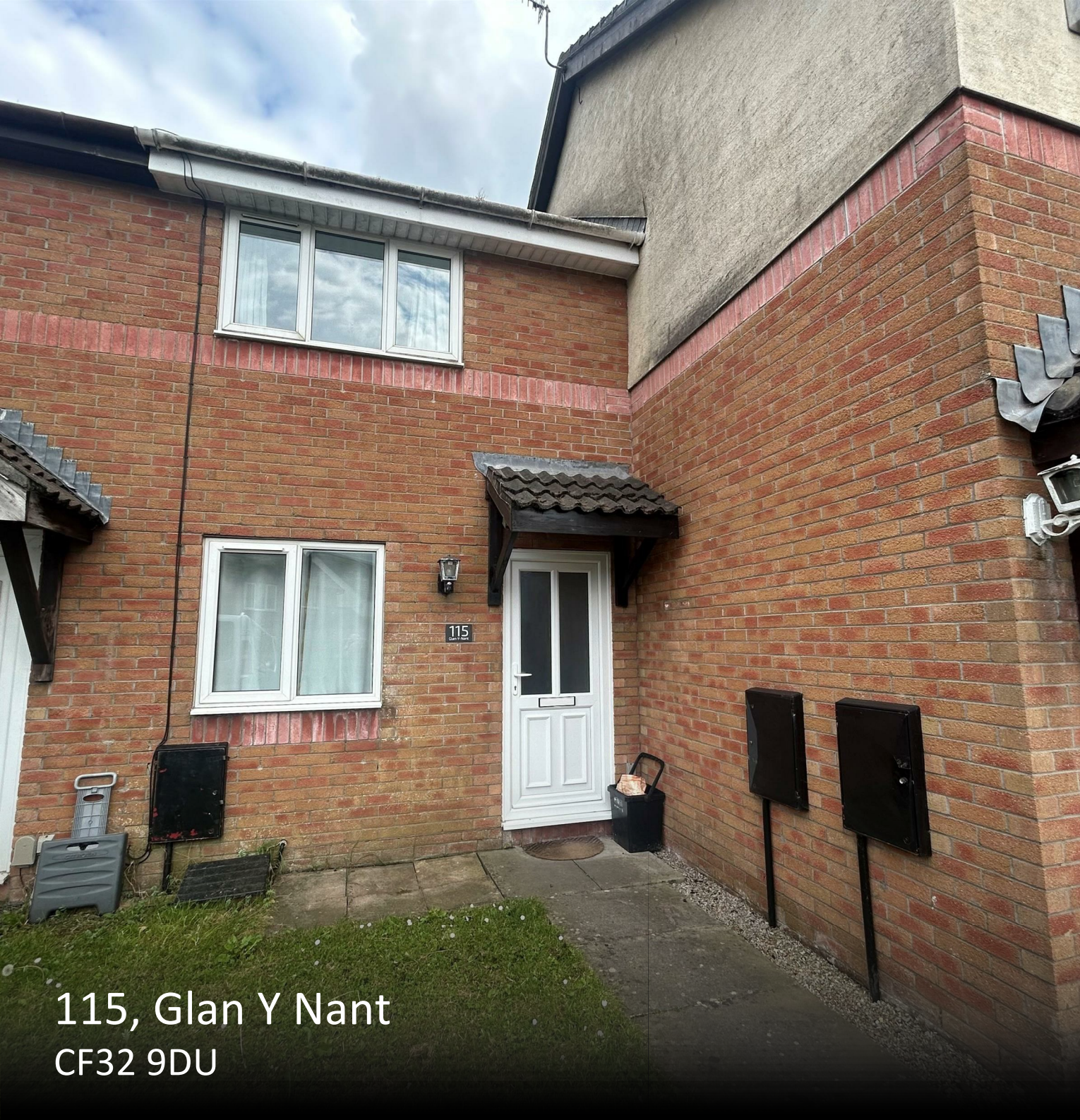
115, Glan Y Nant CF32 9DU