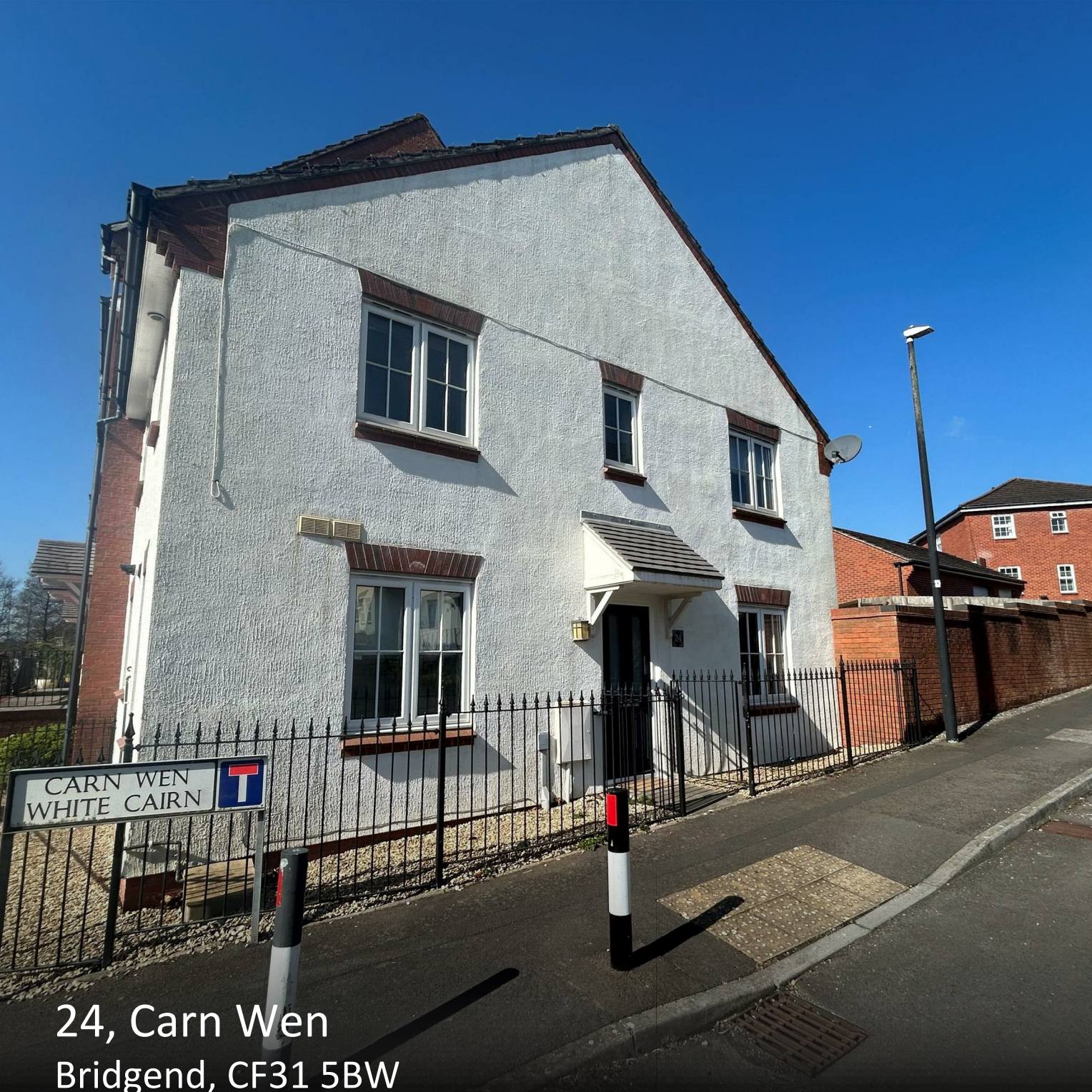
24, Carn Wen Bridgend, CF31 5BW