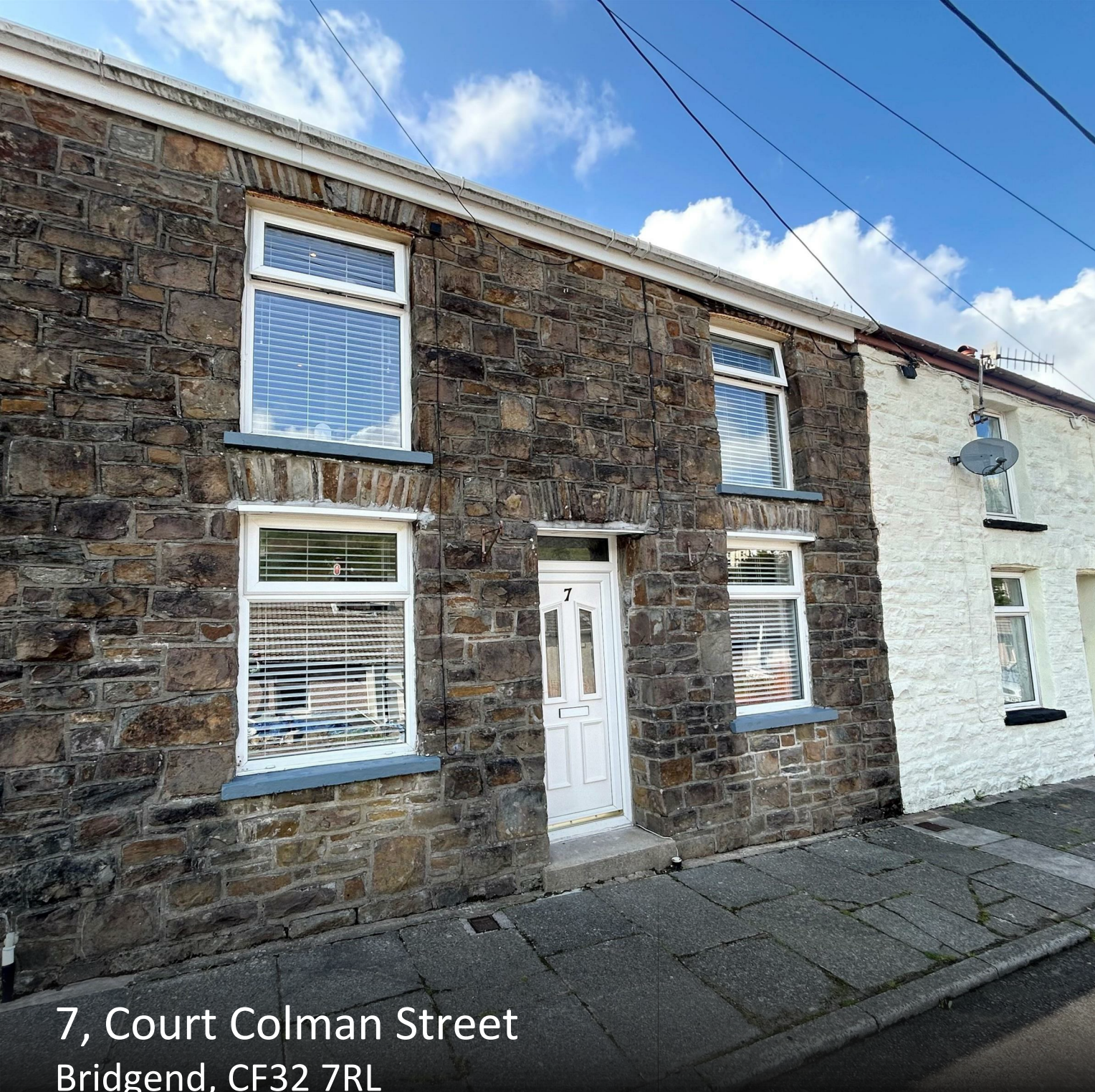
7, Court Colman Street Bridgend, CF32 7RL