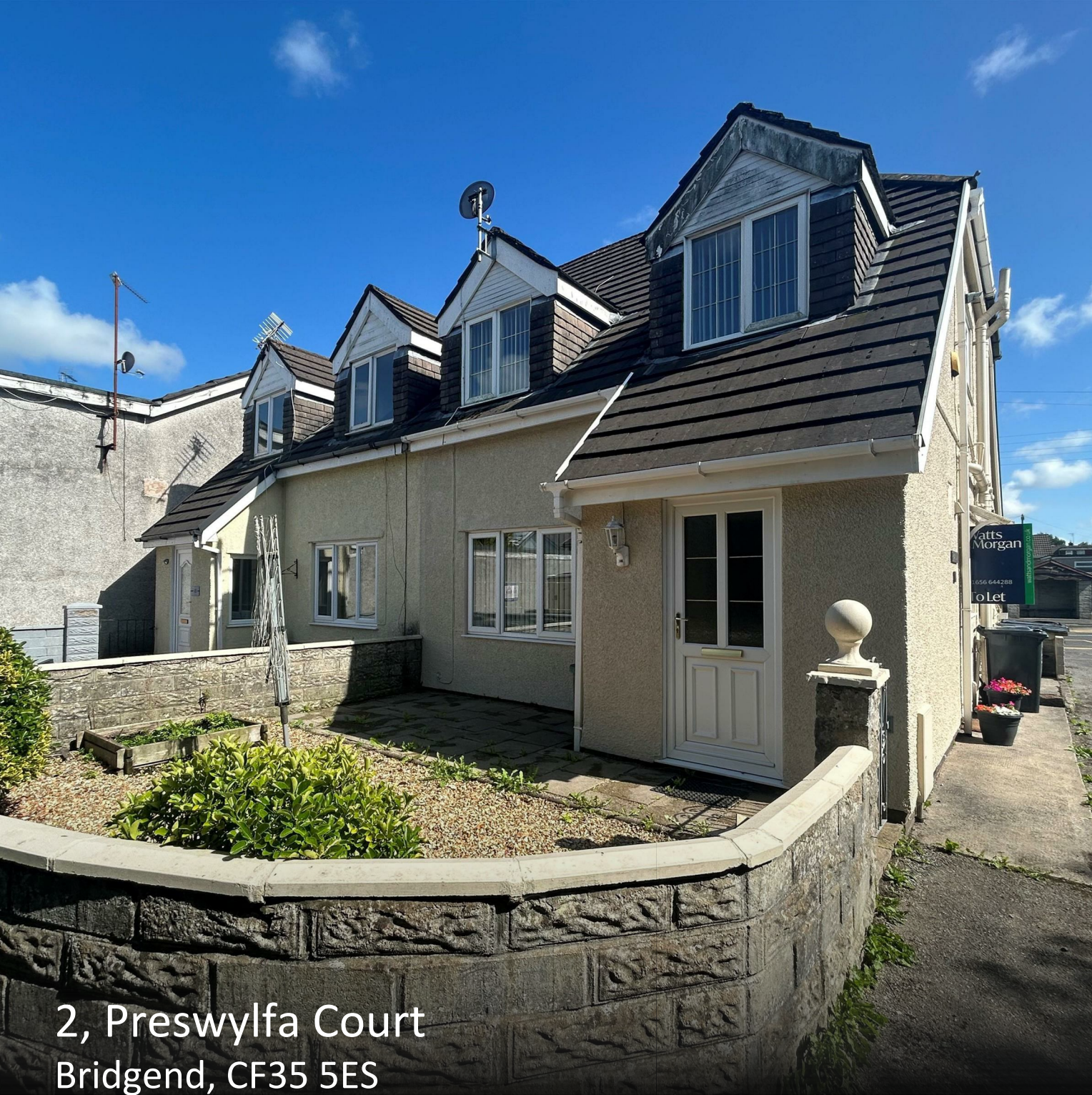
2, Preswylfa Court Bridgend, CF35 5ES