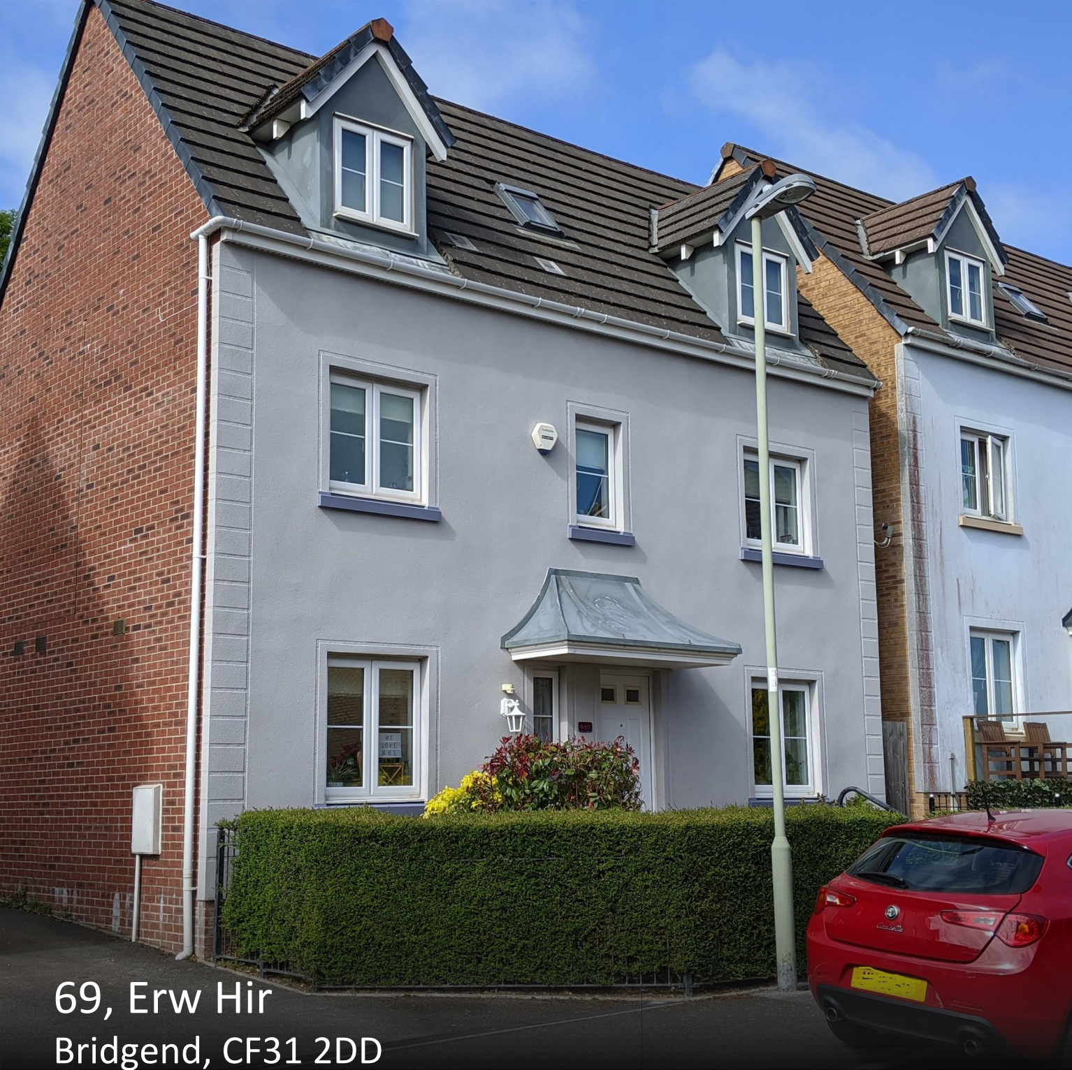
69, Erw Hir Bridgend, CF31 2DD