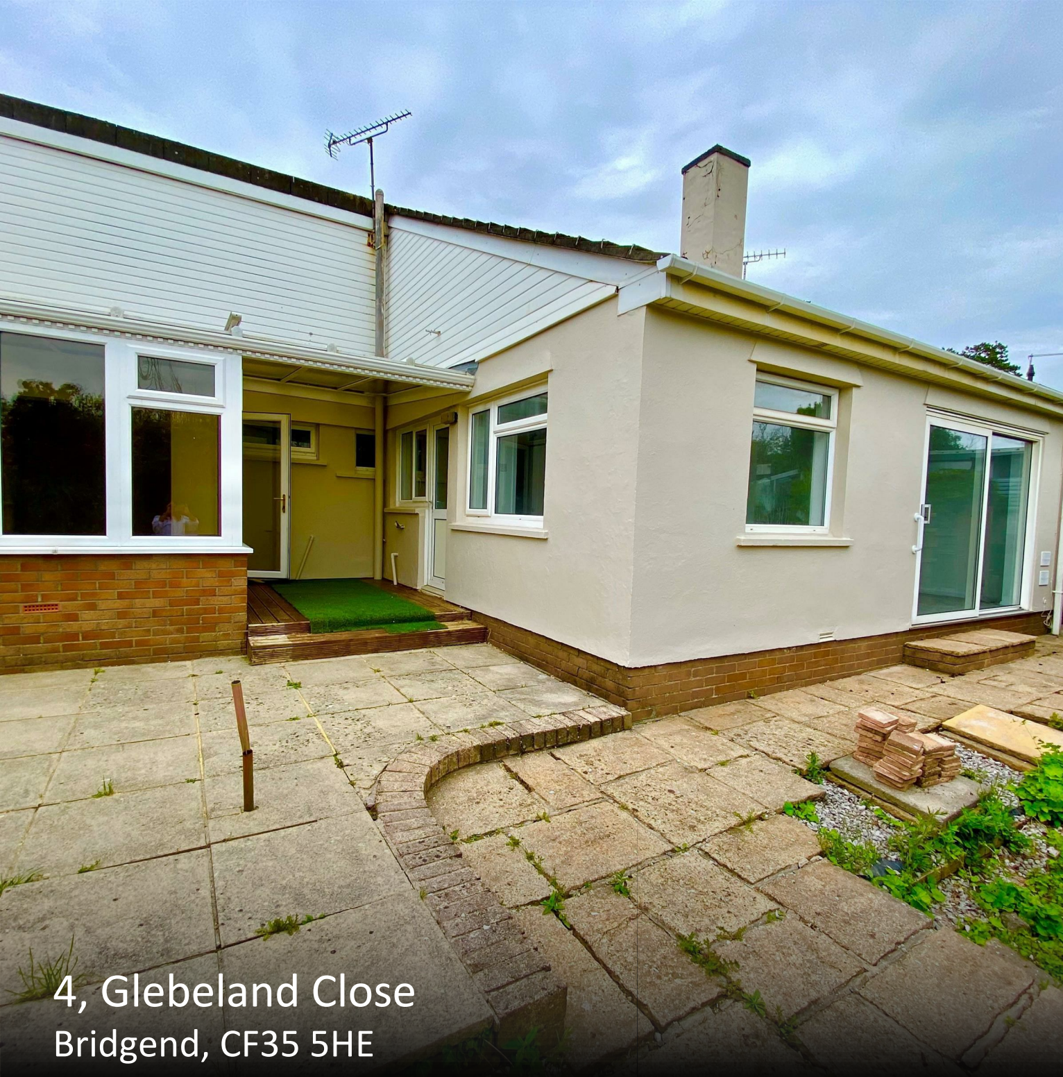
4, Glebeland Close Bridgend, CF35 5HE