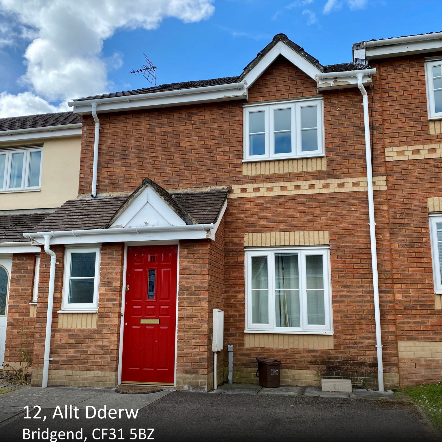
12, Allt Dderw Bridgend, CF31 5BZ