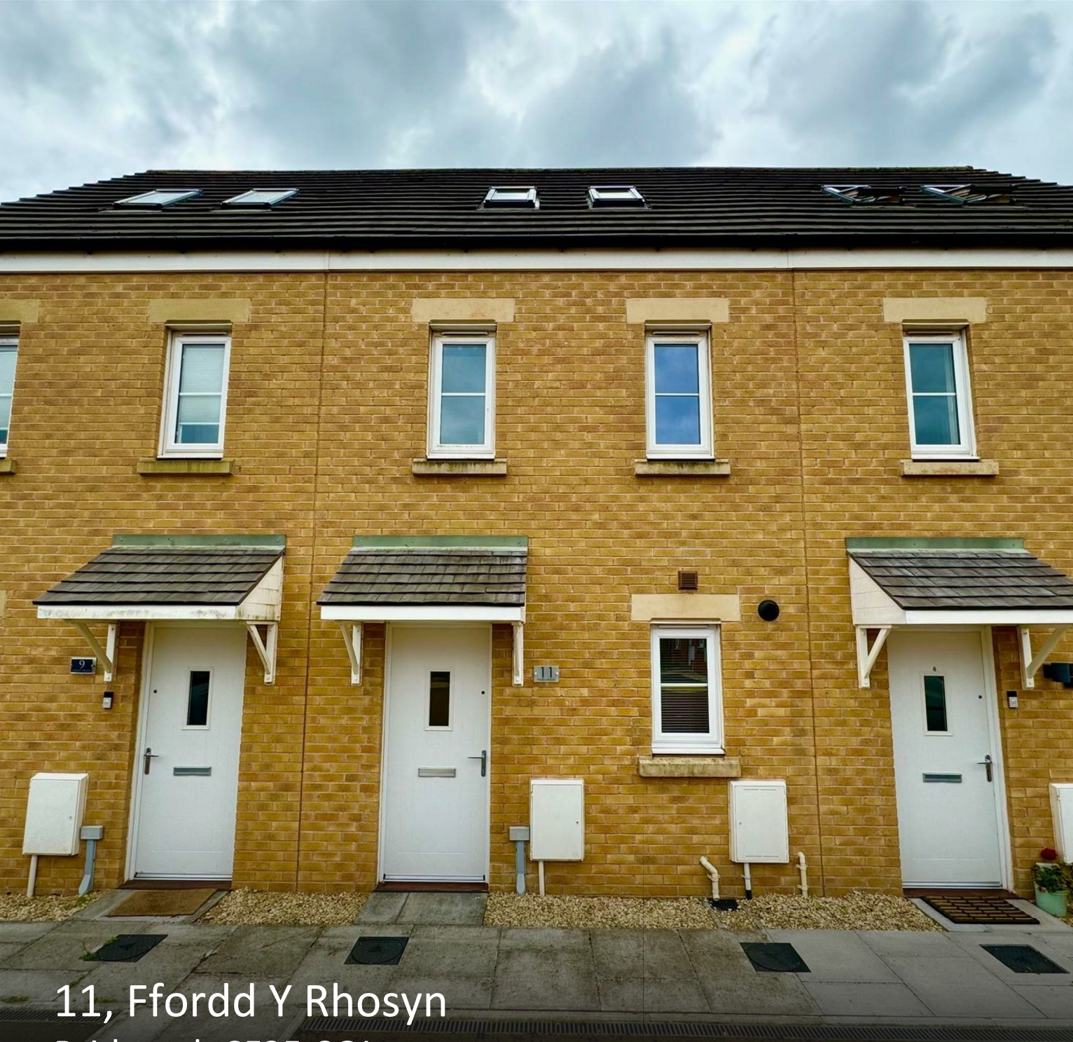
11, Ffordd Y Rhosyn Bridgend, CF35 6GJ