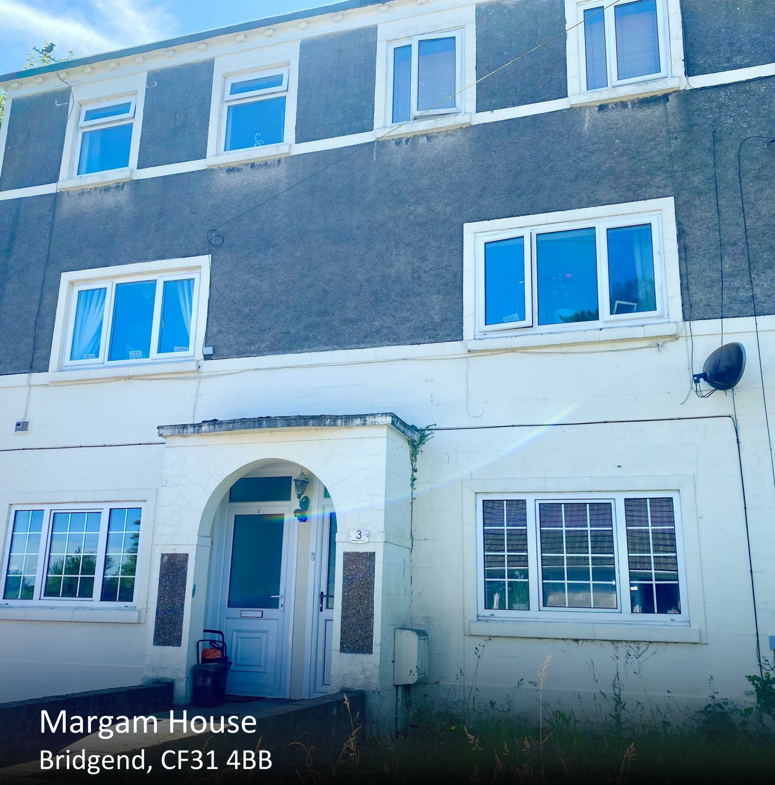
Margam House Bridgend, CF31 4BB