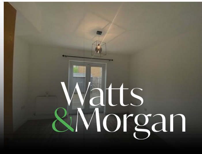
29D, Rhodfa Cnocell Y Coed Broadlands, CF31 5FS