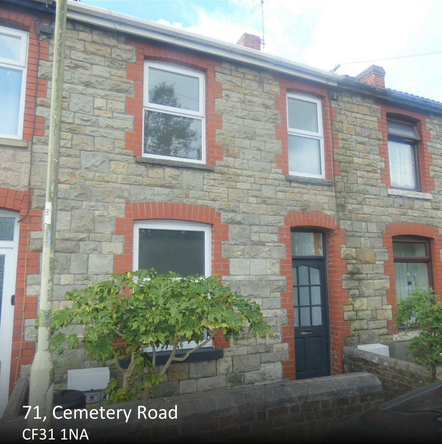
71, Cemetery Road CF31 1NA