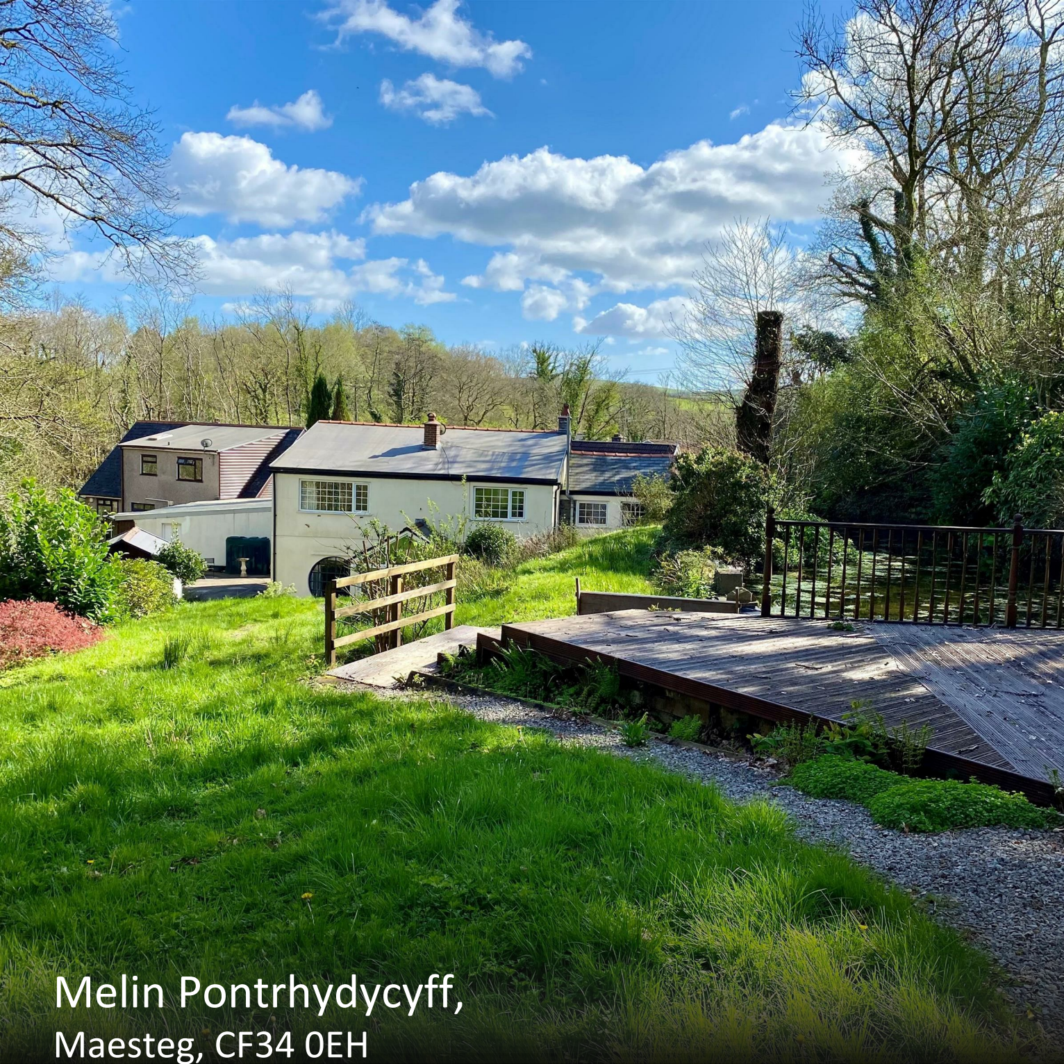
Melin Pontrhydycyff, Maesteg, CF34 0EH