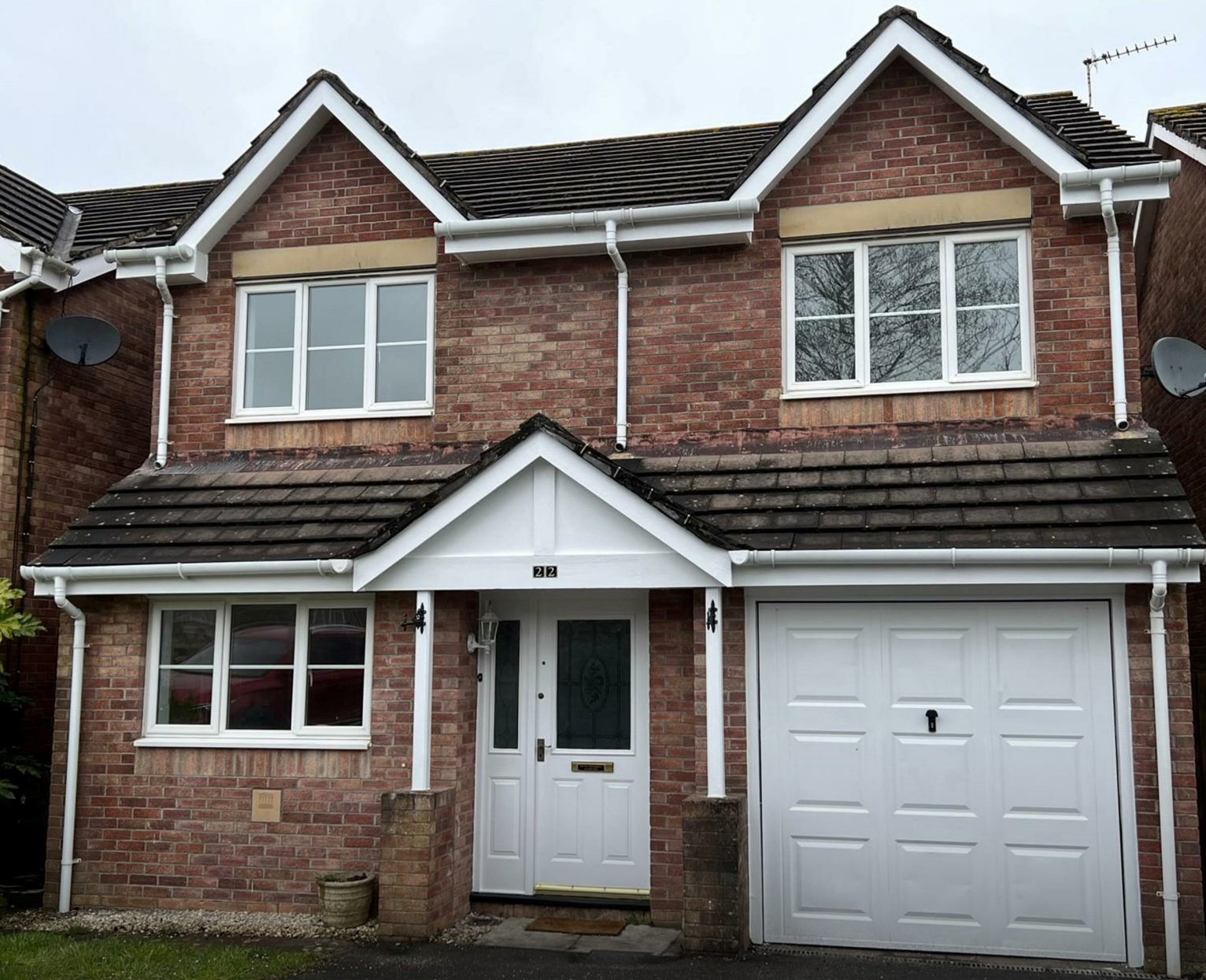
22, Llys Pentre Bridgend, CF31 5DY