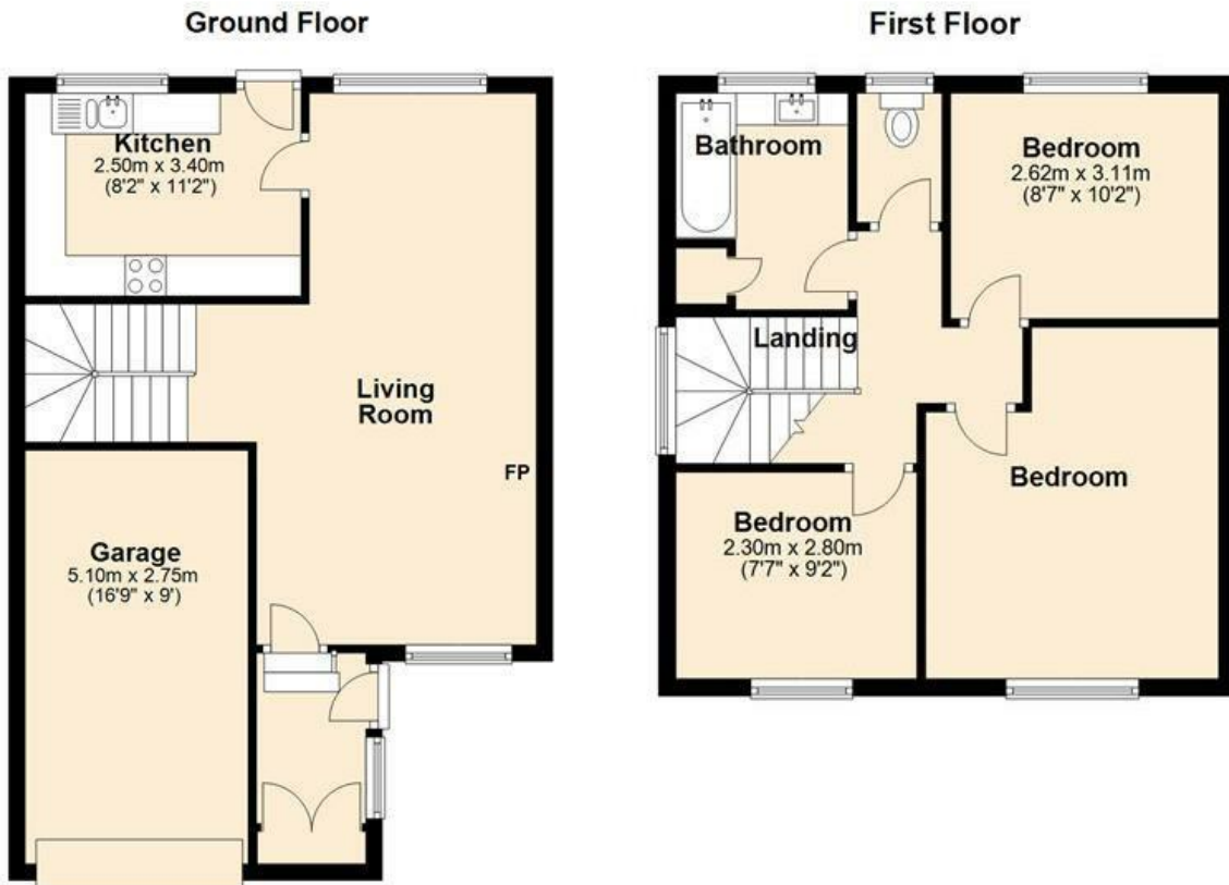
87 REDOAK, BARROW

Corrie and Co aim to sell your property, at the best possible price, in the shortest possible time. We have developed a clear marketing strategy, over many years, to ensure your property is exposed to all social media platforms, Rightmove, Zoopla and our own Corrie and Co website.