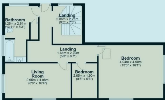
BRIAR BANK, BROUGHTON