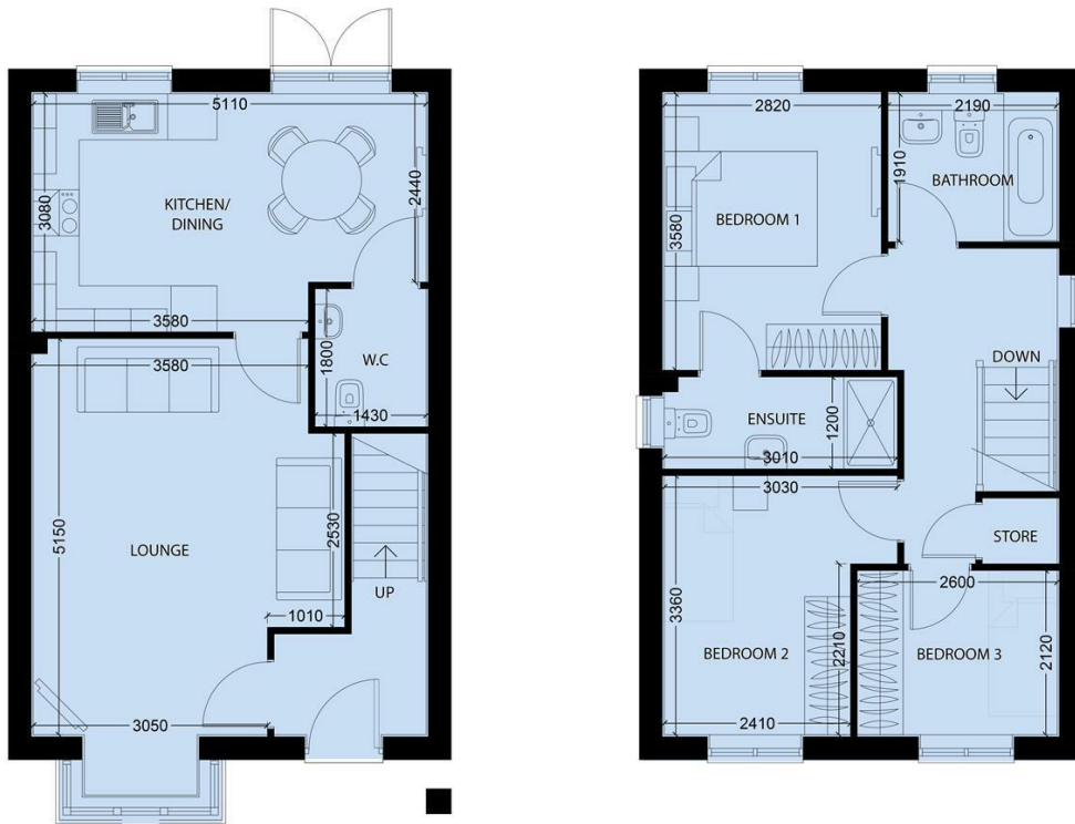
TYPE D18 FOR APPROVAL

Corrie and Co aim to sell your property, at the best possible price, in the shortest possible time. We have developed a clear marketing strategy, over many years, to ensure your property is exposed to all social media platforms, Rightmove, Zoopla and our own Corrie and Co website.