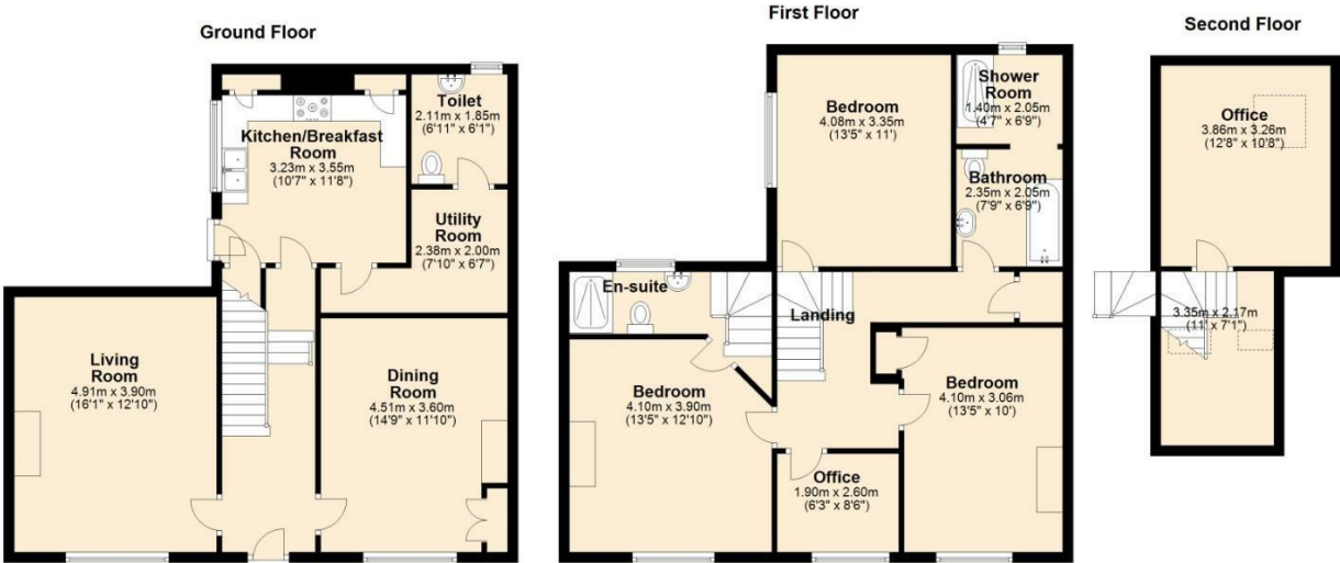
36 fountain street, Ulverston

Corrie and Co aim to sell your property, at the best possible price, in the shortest possible time. We have developed a clear marketing strategy, over many years, to ensure your property is exposed to all social media platforms, Rightmove, Zoopla and our own Corrie and Co website.