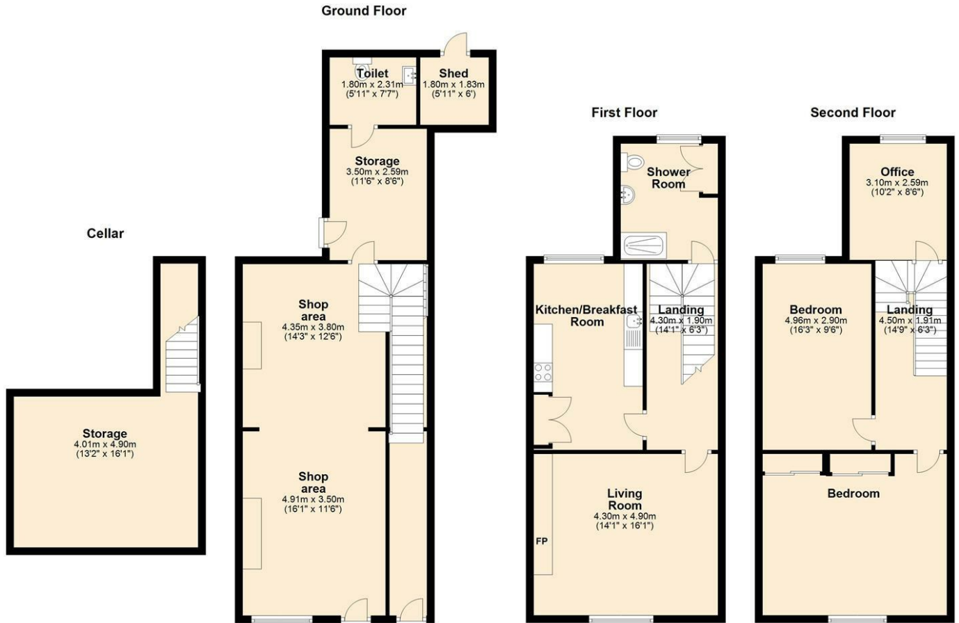
14 Yewdale Road, Conniston

Corrie and Co aim to sell your property at the best possible price in the shortest possible time. We have developed a clear marketing strategy to ensure that your property is fully exposed to the local, regional and national market place and we are confident that we can provide a marketing service second to none. Our Sales Team offer: