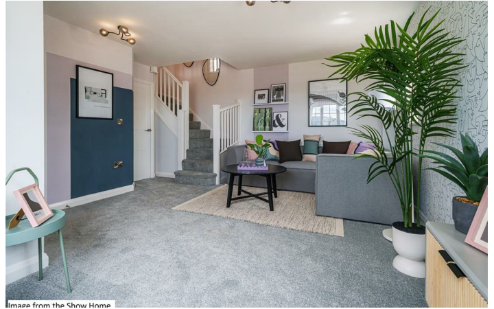
Image from the Show Home