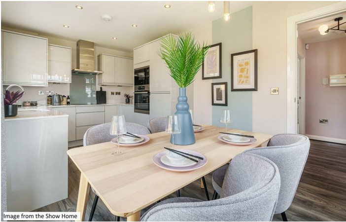
Image from the Show Home