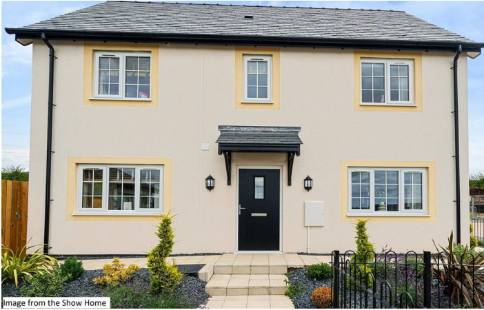
Image from the Show Home