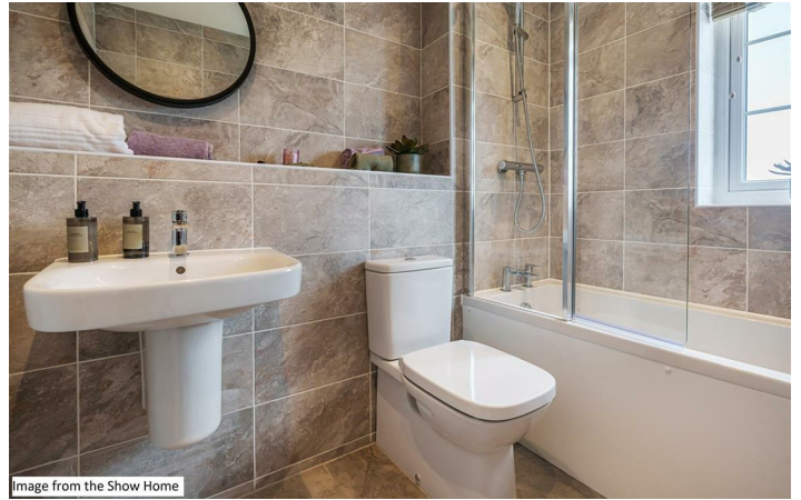
Image from the Show Home