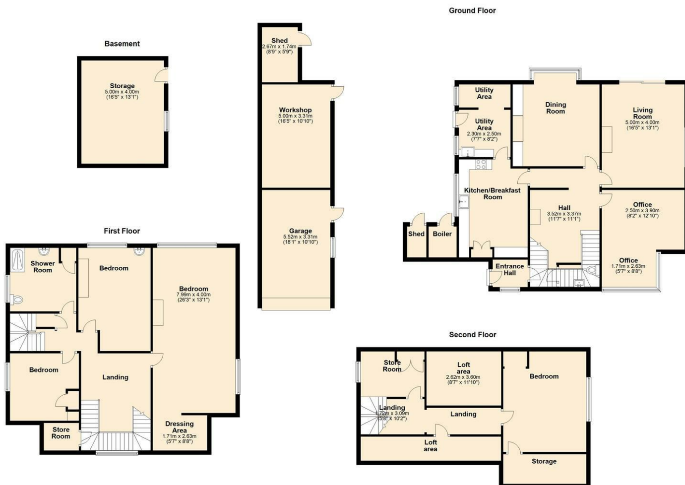
13 THE DRIVE, Ulverston

Corrie and Co aim to sell your property at the best possible price in the shortest possible time. We have developed a clear marketing strategy to ensure that your property is fully exposed to the local, regional and national market place and we are confident that we can provide a marketing service second to none. Our Sales Team offer: