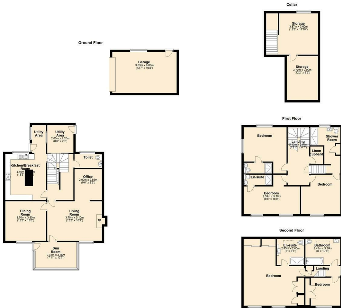
TRAVELLERS LODGE, ULPHA

Corrie and Co aim to sell your property at the best possible price in the shortest possible time. We have developed a clear marketing strategy to ensure that your property is fully exposed to the local, regional and national market place and we are confident that we can provide a marketing service second to none. Our Sales Team offer: