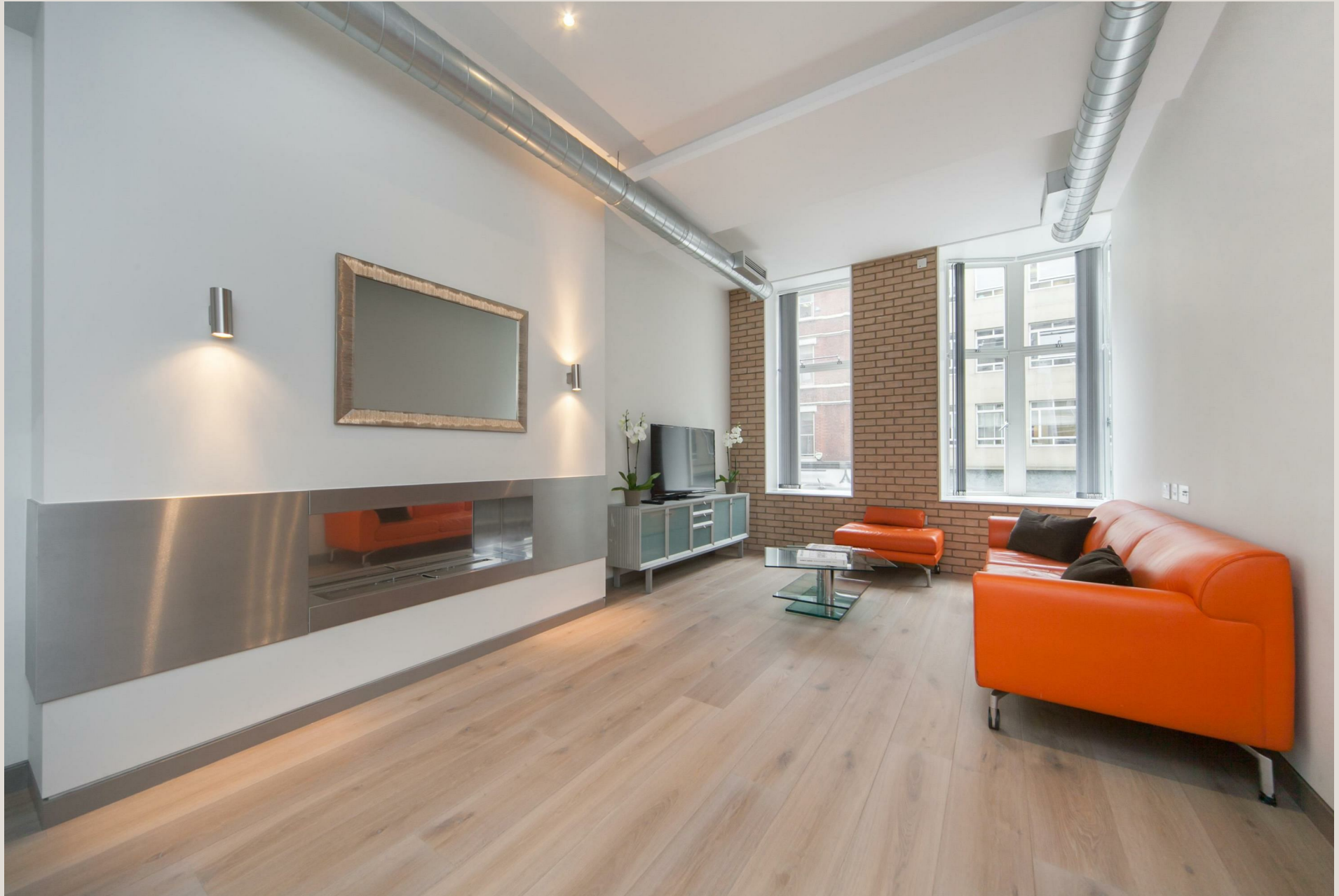
13a Berners Street