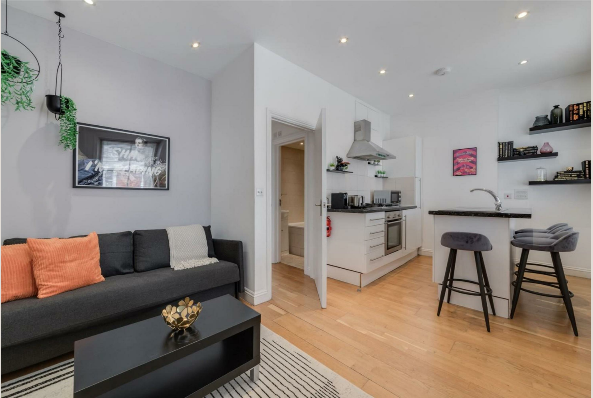
59 Great Titchfield Street