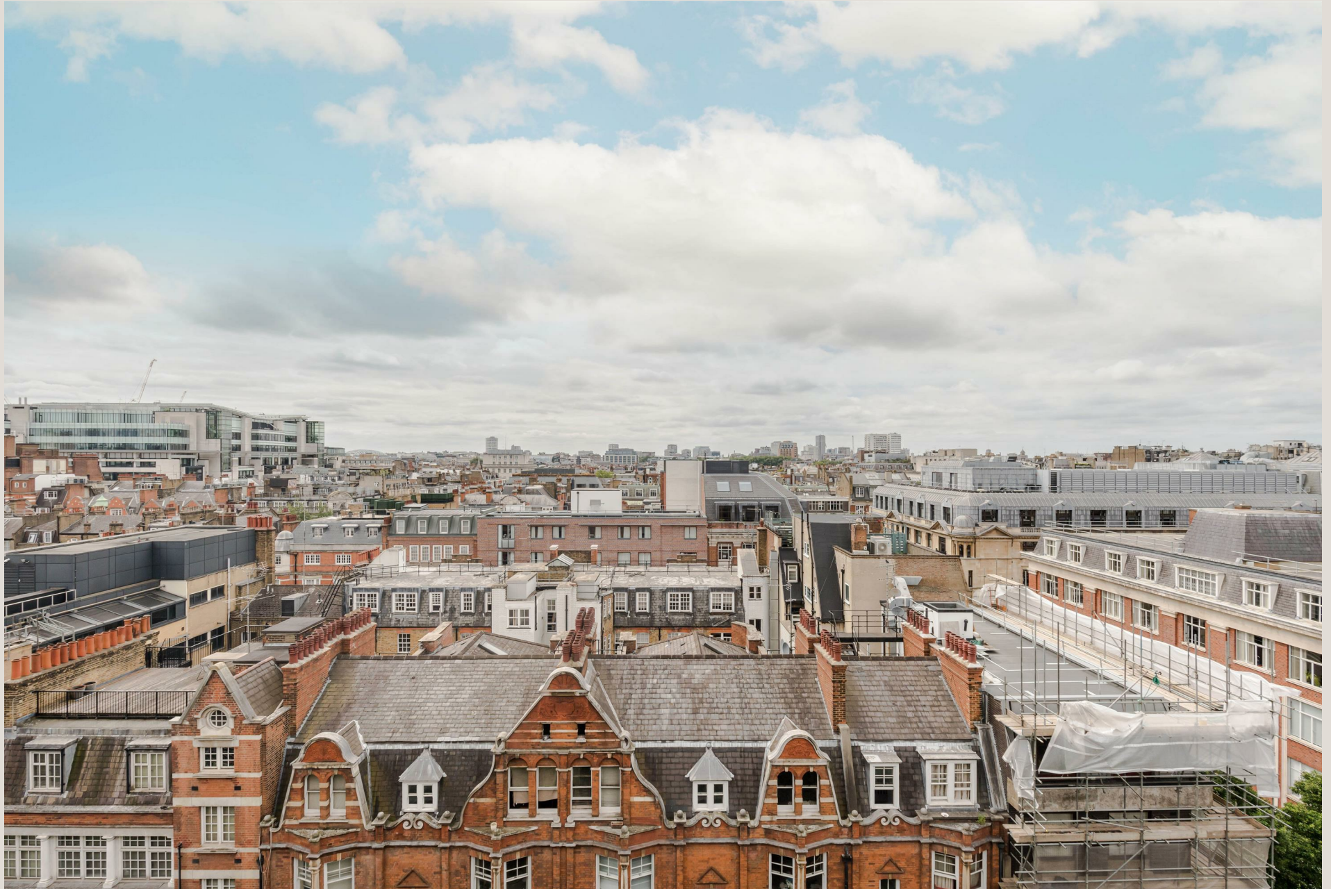
New Cavendish Street