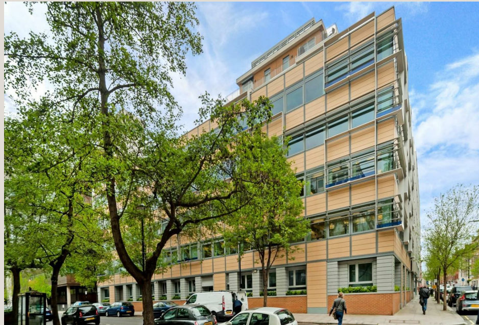
New Cavendish Street