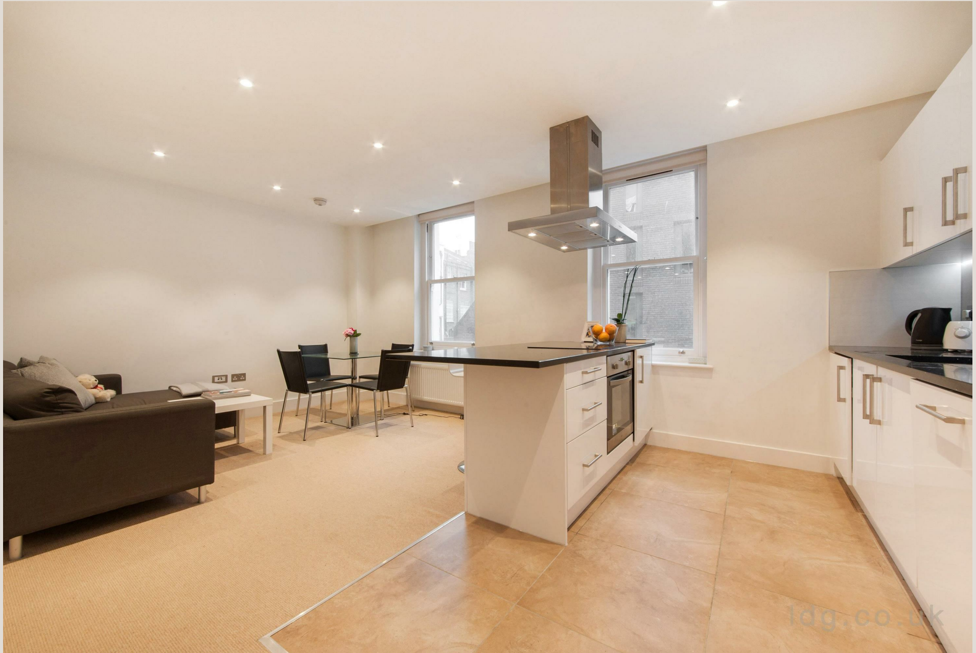
65 Lisson Street