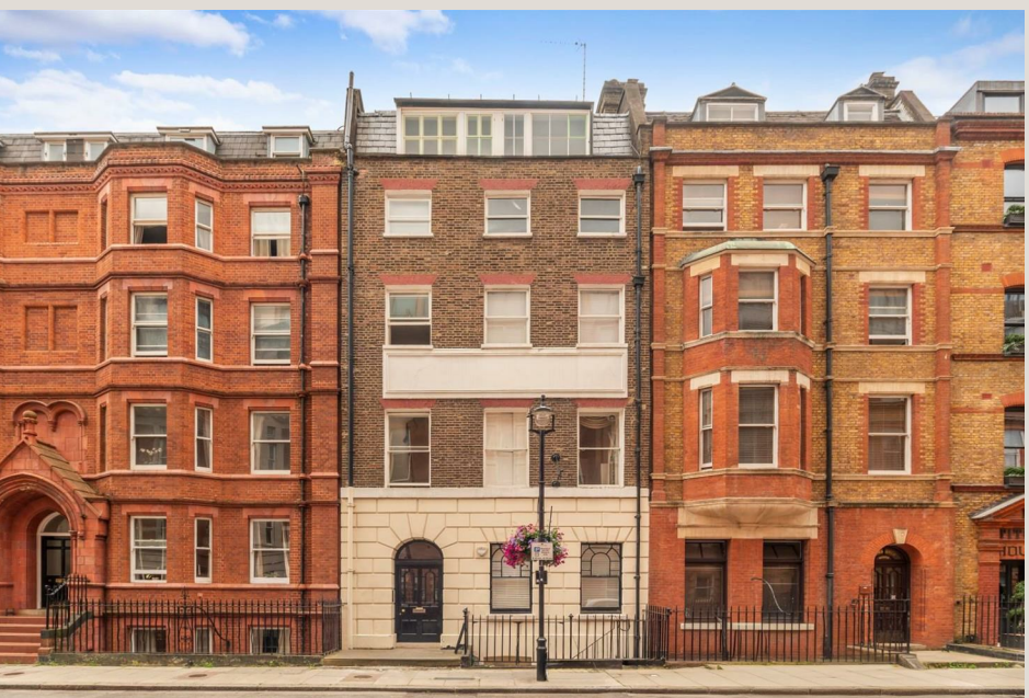
20 Nassau Street