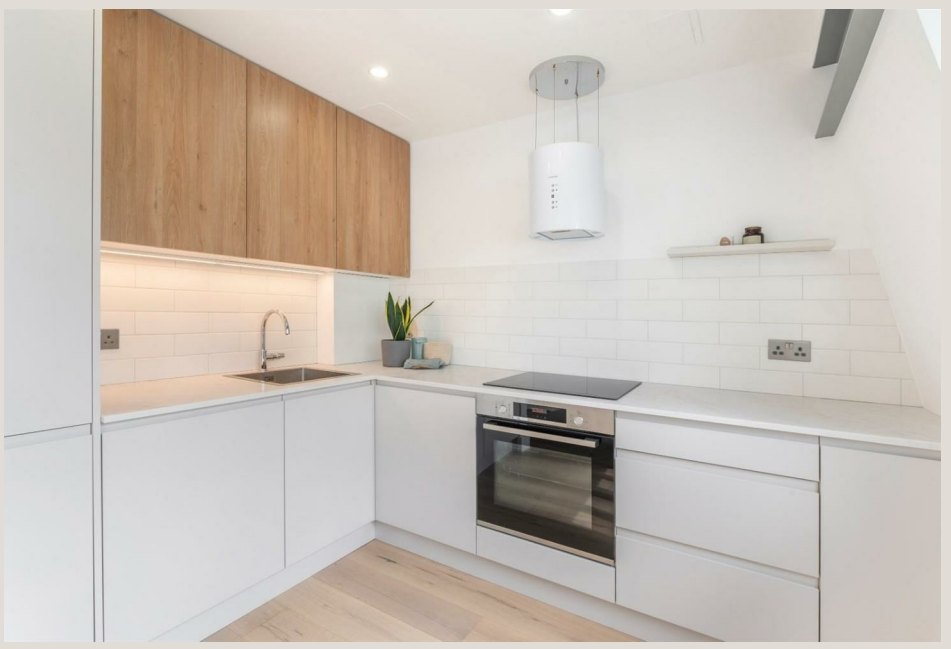
20 Nassau Street