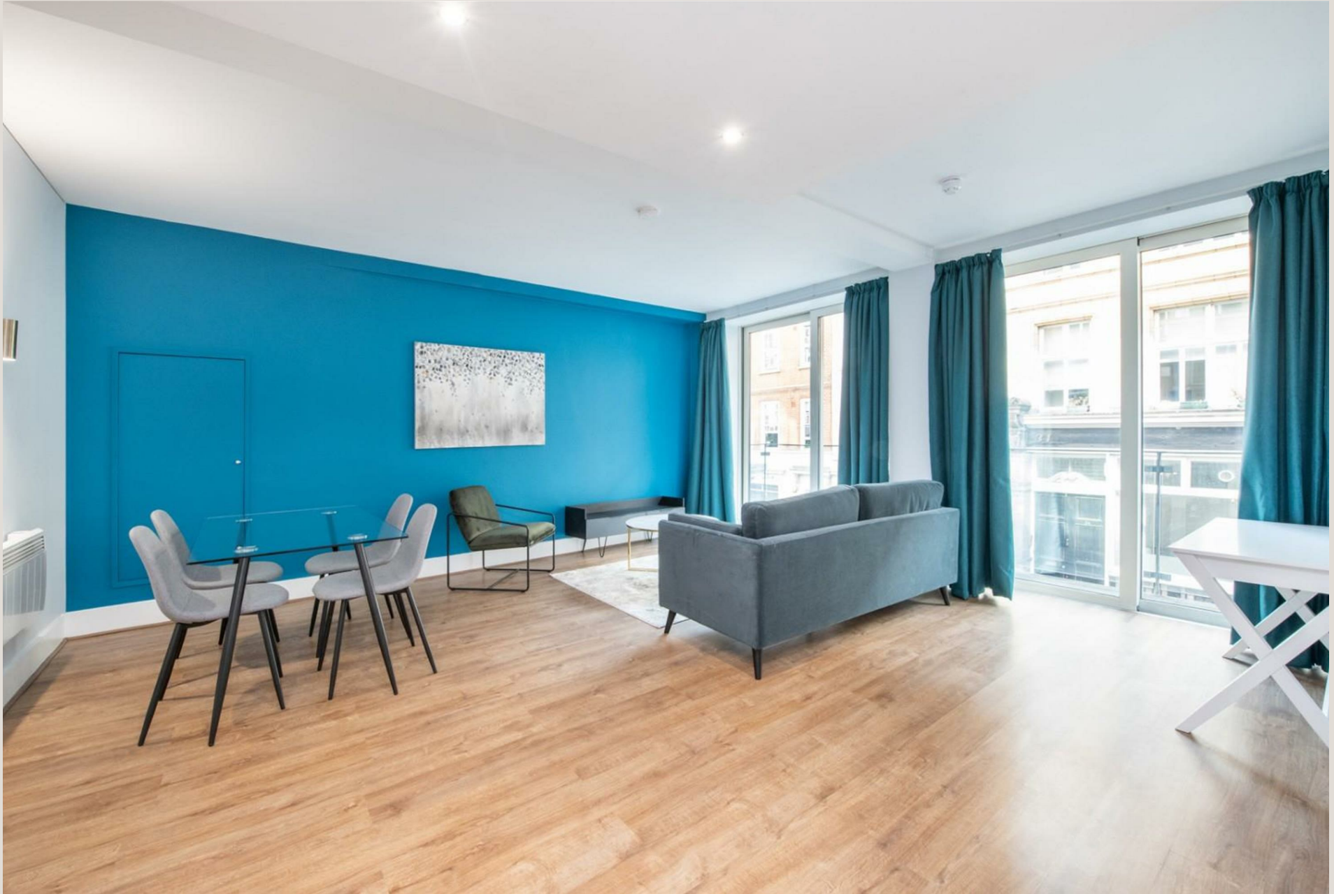
9 Great Pulteney Street