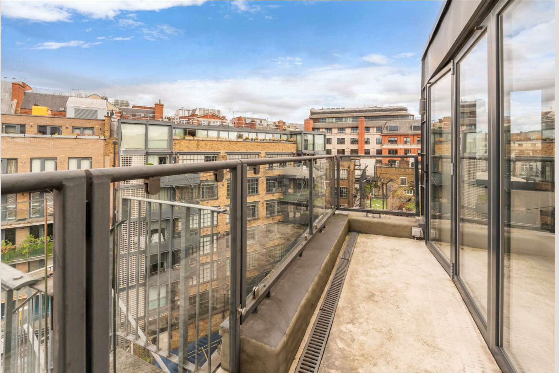
120 Drury Lane