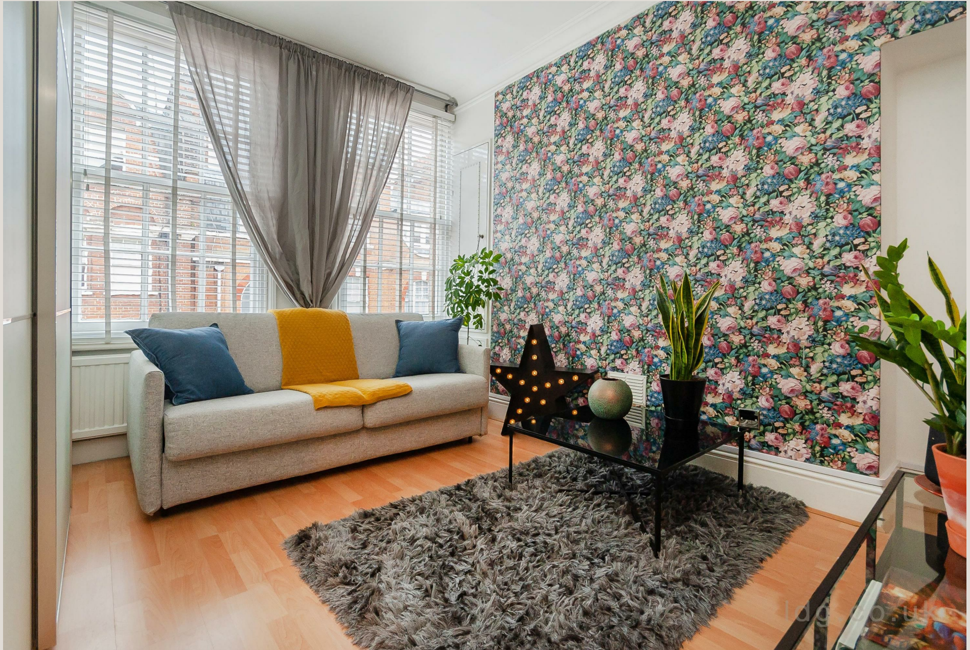
14 Hanson Street