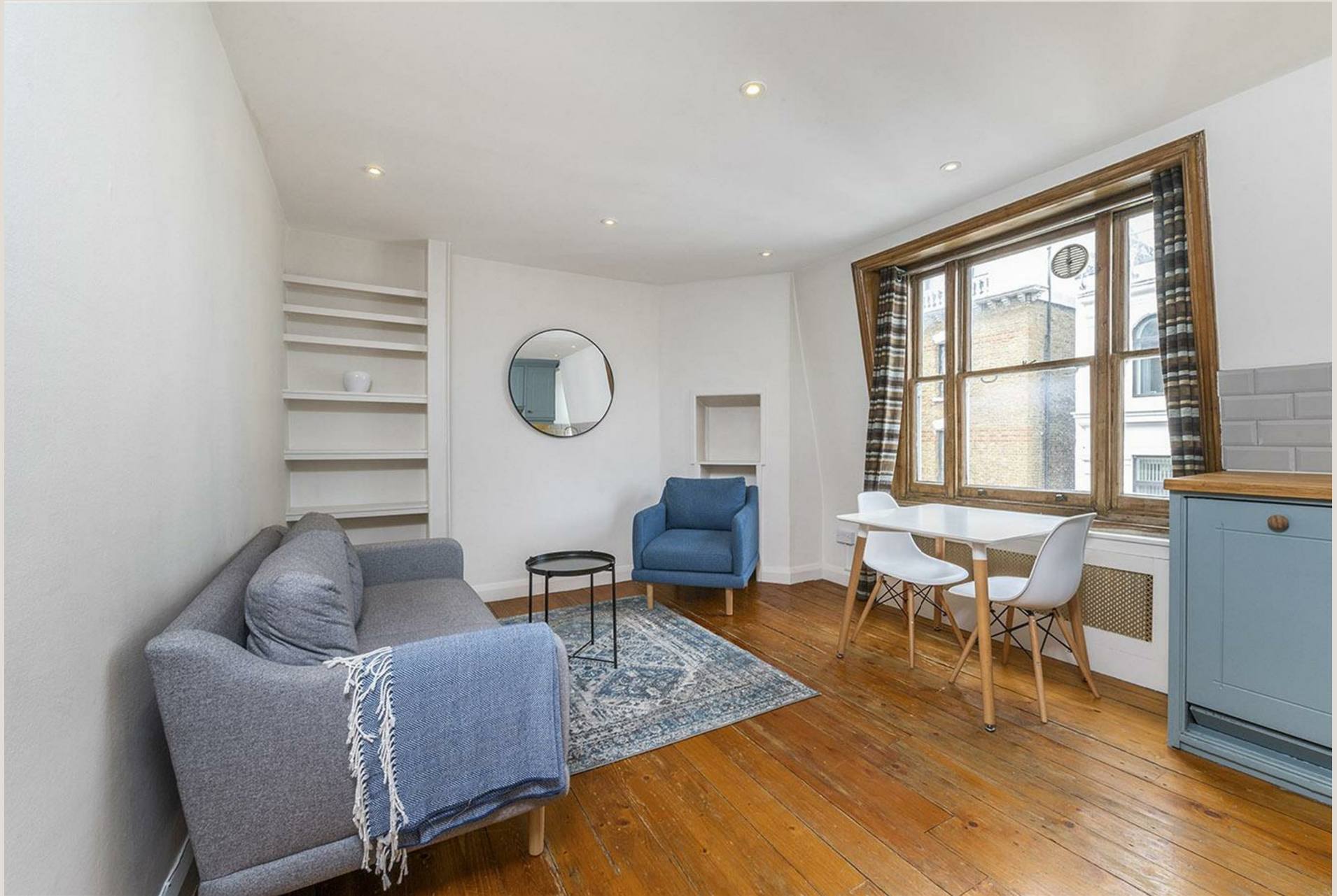
16 Great Newport Street