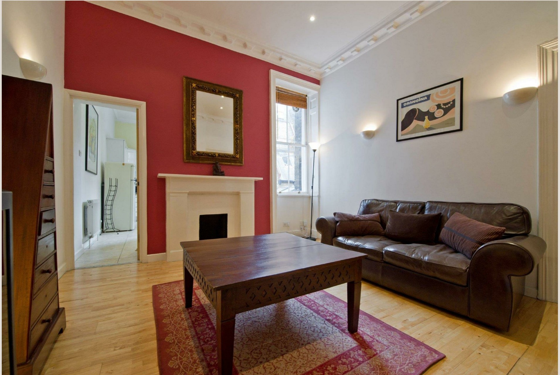
95 Great Titchfield Street