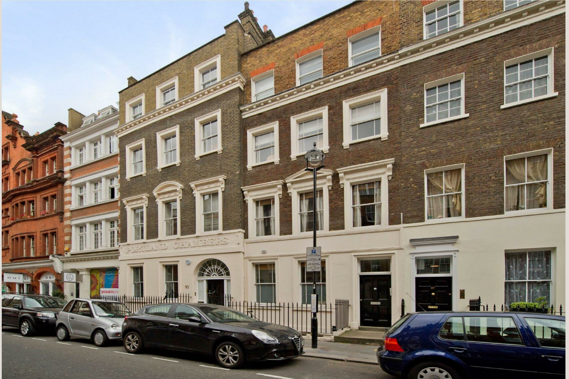
95 Great Titchfield Street