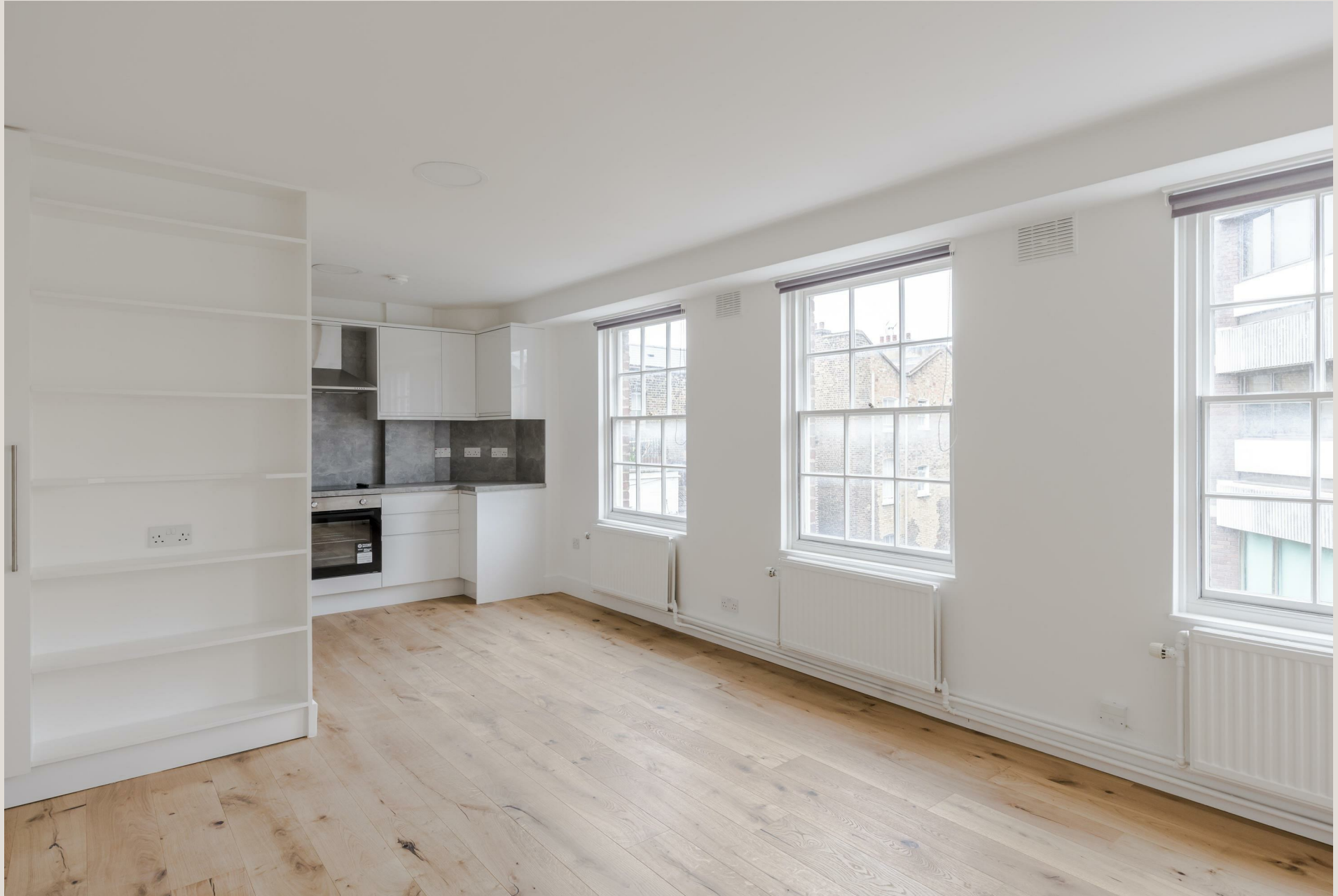
36-40 Maple Street