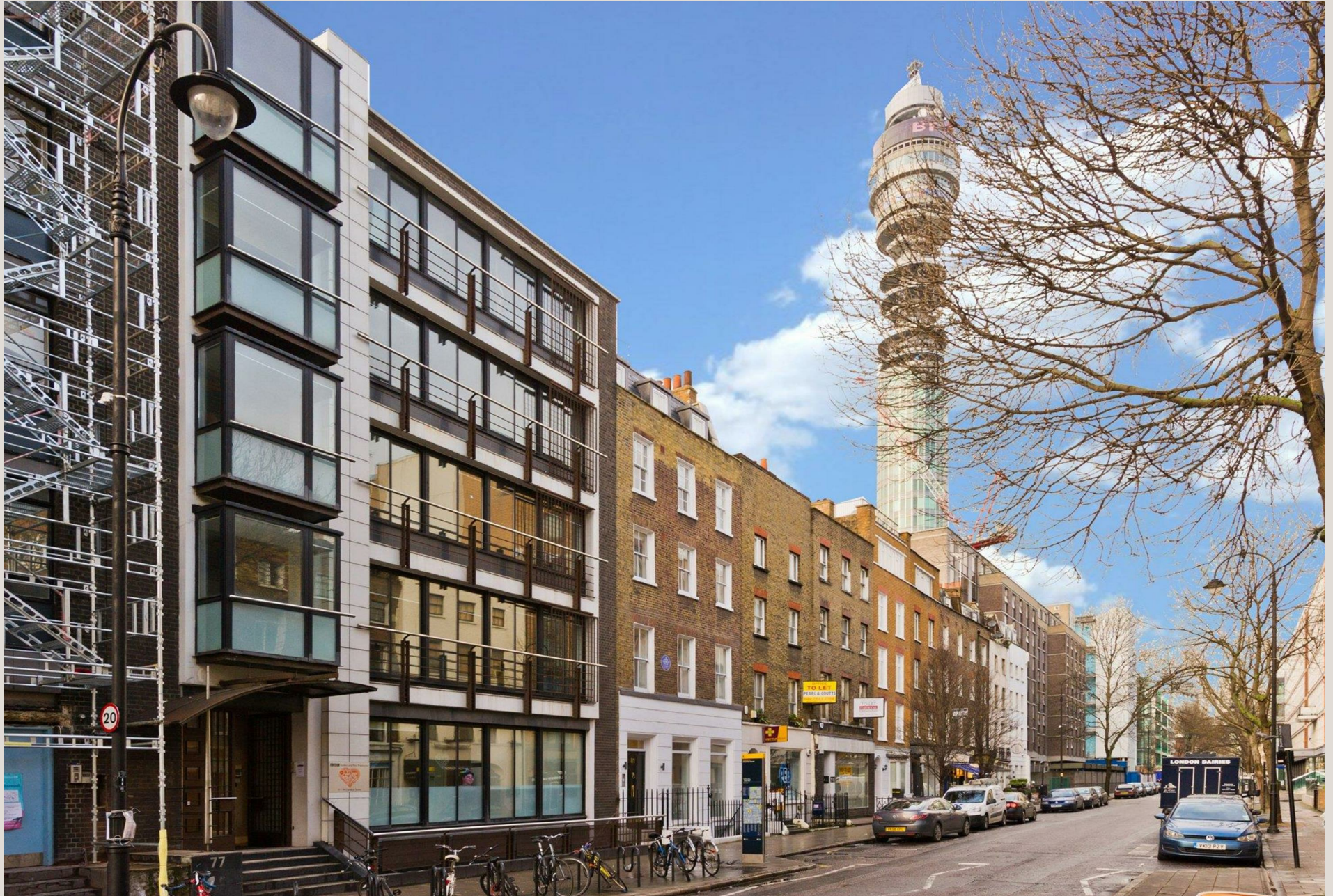
81 Charlotte Street