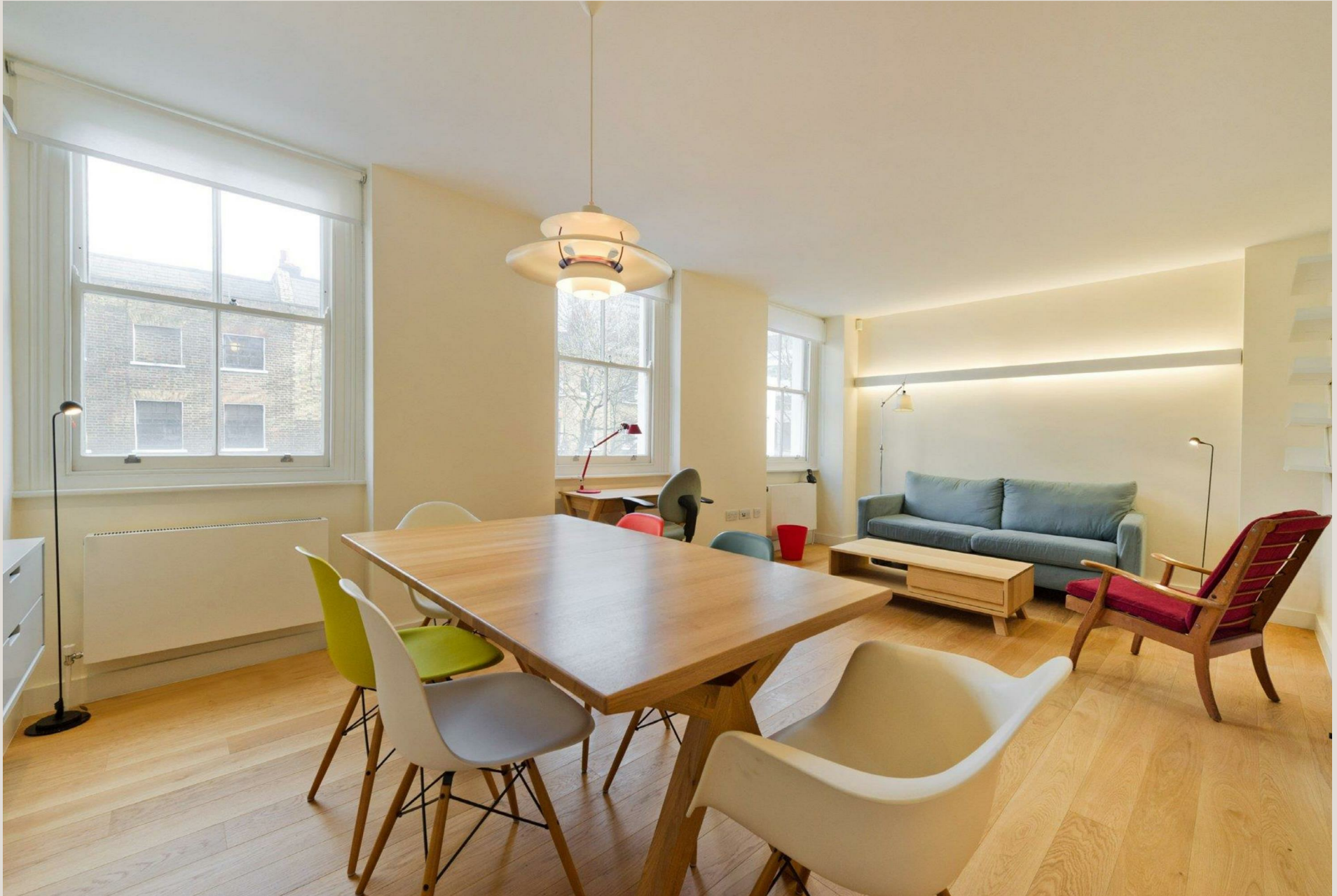
81 Charlotte Street