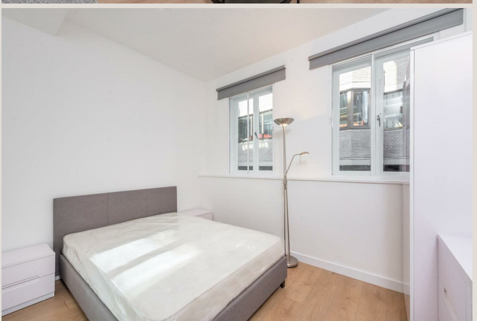
49 Marshall Street