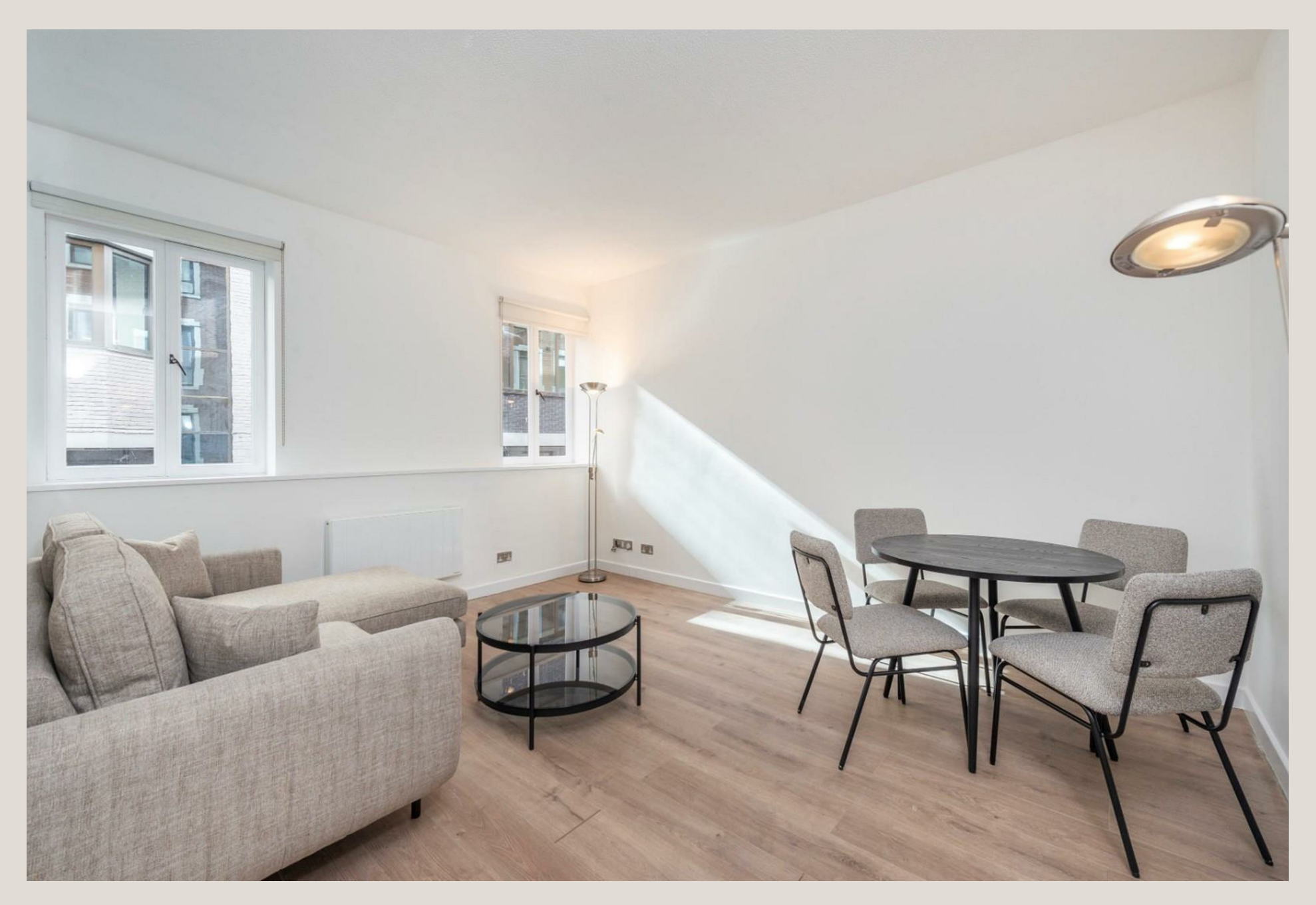
49 Marshall Street