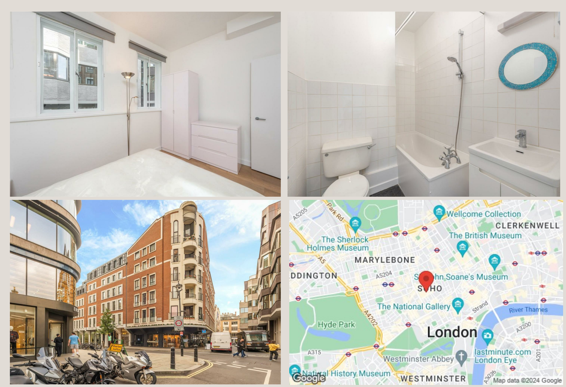
49 Marshall Street